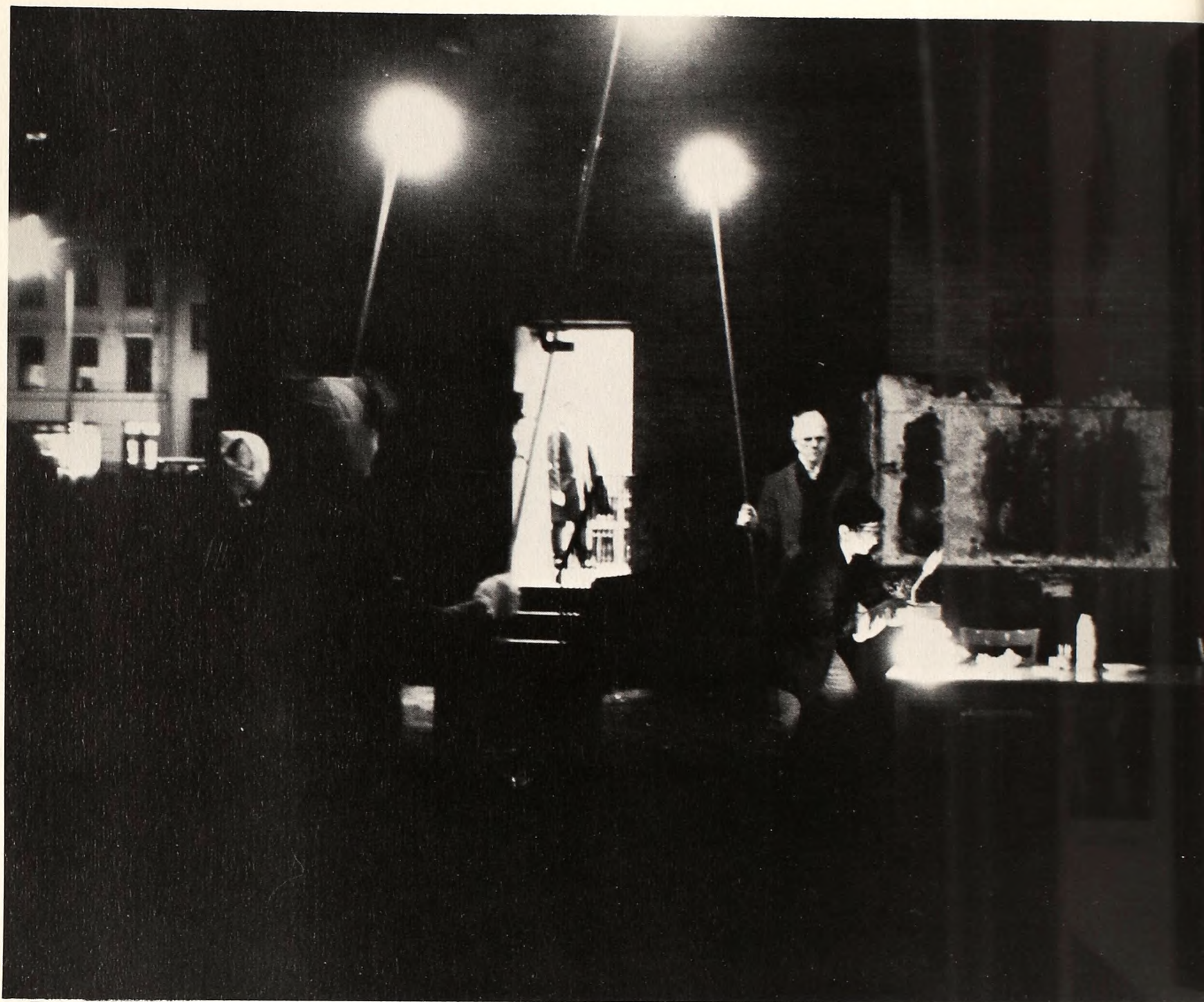
Would you believe . . . a birthday party?