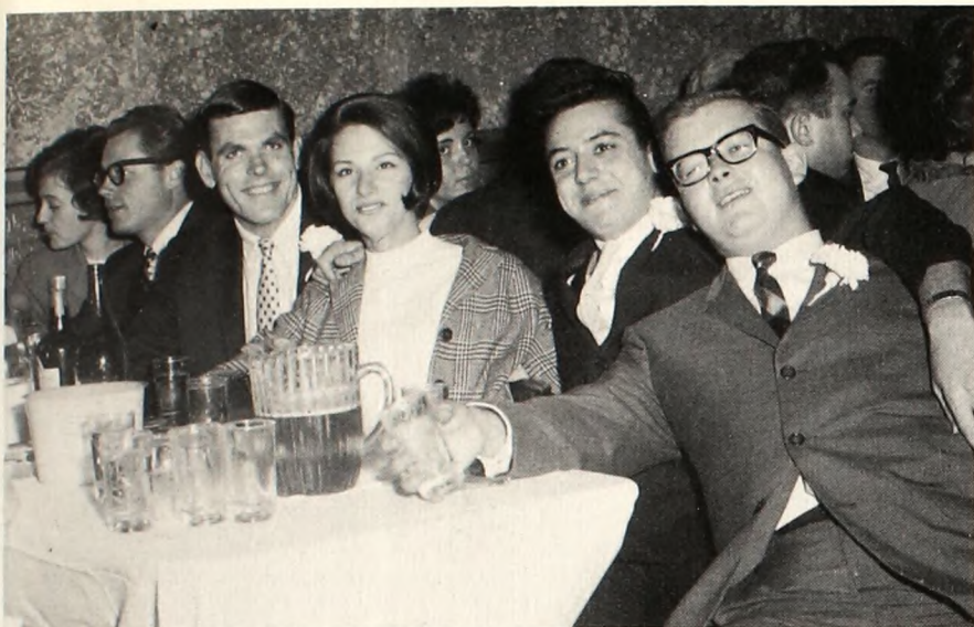
"Three jolly Phi Rho men . . .", or was that four???