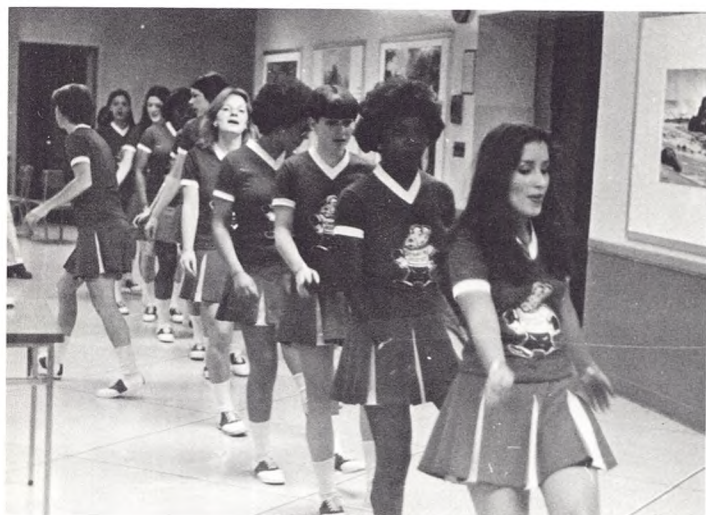
10 cents a dance.