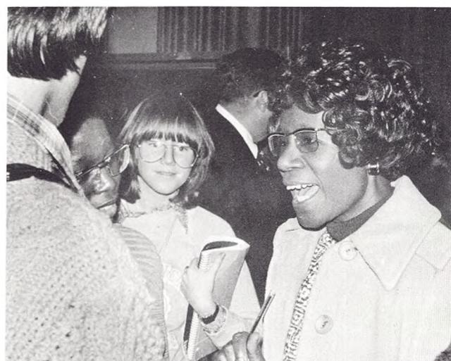
I go to the same dentist as Jimmy Carter!