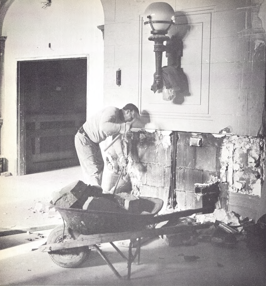
WORKMEN TORE OUT THE GUTS . . .

A job to be done: THE STORY OF 1962 - 1963 We waited while . . .