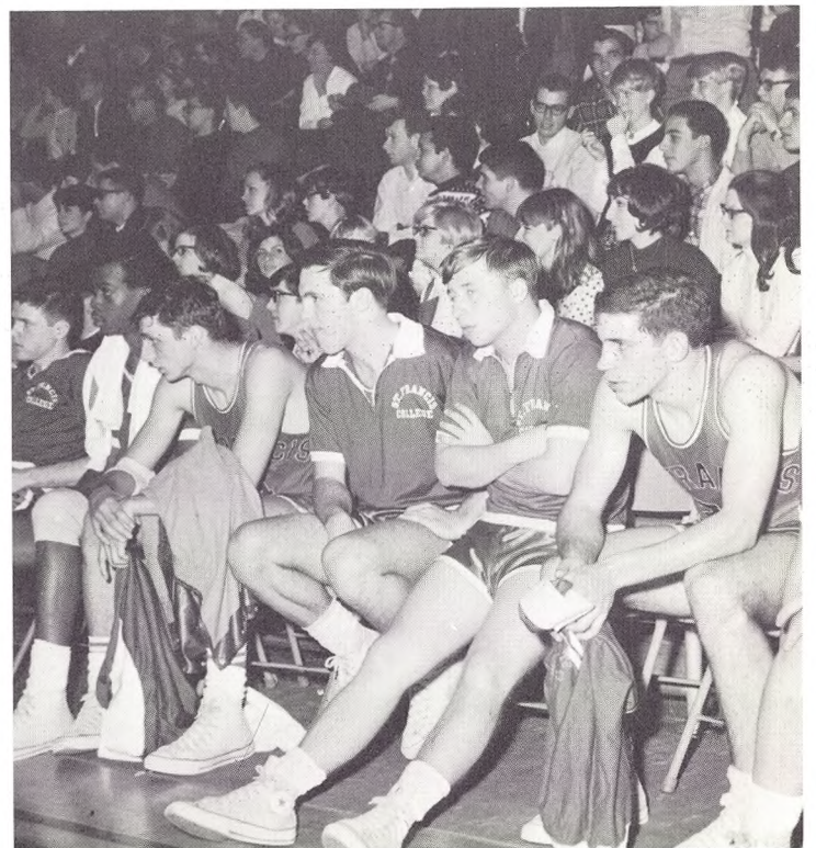
Our reinforcements concentrate on the action on the court.