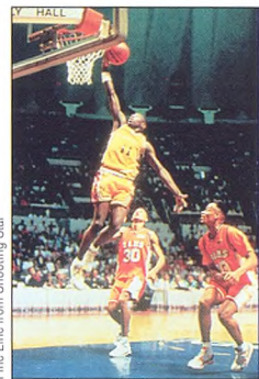
Fine Line from Shooting Star

"Baywatch," the world's most-watched syndicated TV show, is a feel-good action/adventure about a Malibu lifeguard, played by David Hasselhoff. Sunny beach scenes take the pressure off plot or character development. In tribute to its popularity, Mattel, Inc. creates Baywatch Barbie.