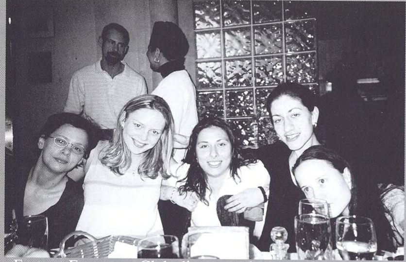
Club dinner at the end of school