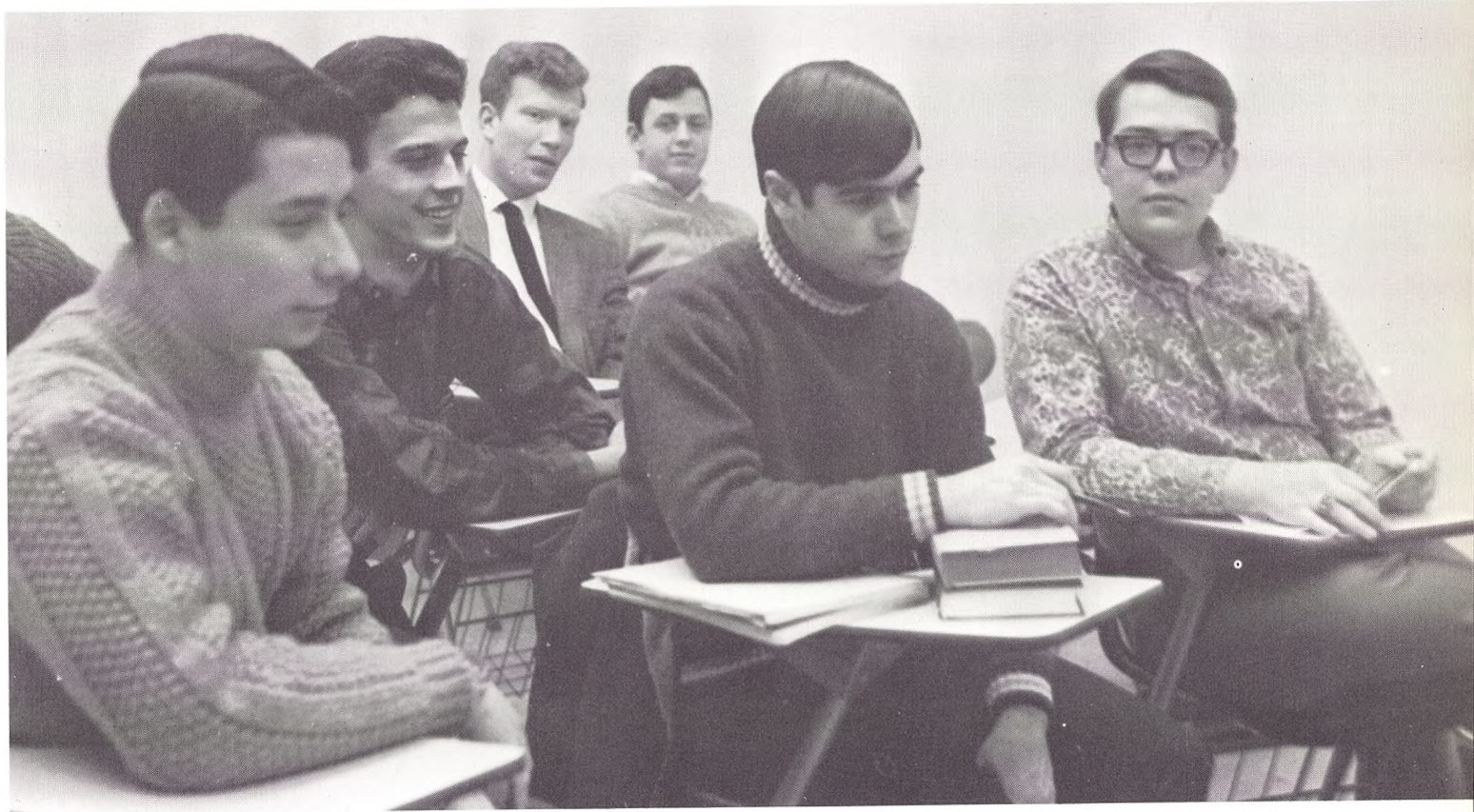
Club members are encouraged to promote safety behind the wheel and to avoid radar.

Although the Motor Sports Club is not an officially recognized activity in St. Francis, it has functioned and expanded independently of any school financial backing for the past two years. Membership, though relatively small, is steady and on a definite increase. During the past year, many of the members have won trophies in various rallies sponsored by different Long Island car clubs.