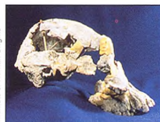
Institute of Human Origins

The century's greatest chemist and antinuclear activist, Linus C. Pauling, winner of the Nobel Prize for Chemistry in 1954 and the Nobel Peace Prize in 1962, dies at the age of 93. His work on DNA laid the foundation for Crick and Watson's discovery of the double helix.