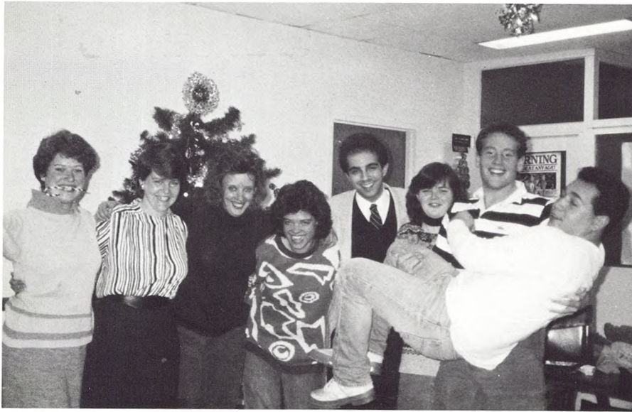
Christmas in the Admissions office.