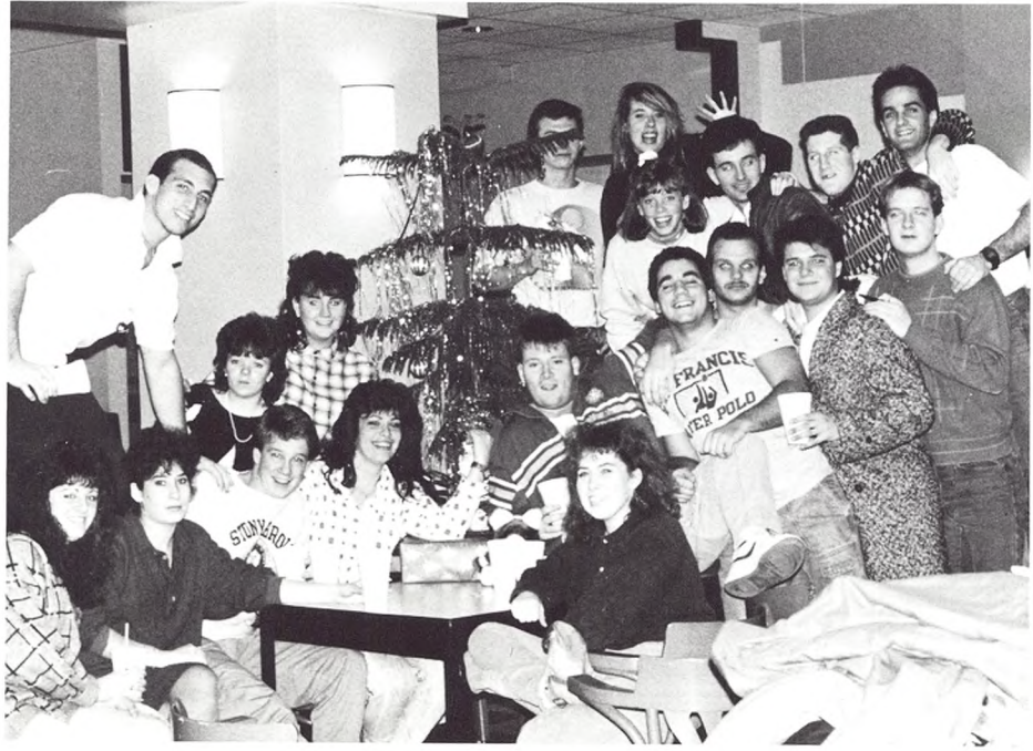
Christmas just would be Christmas without a S.F.C. Party.