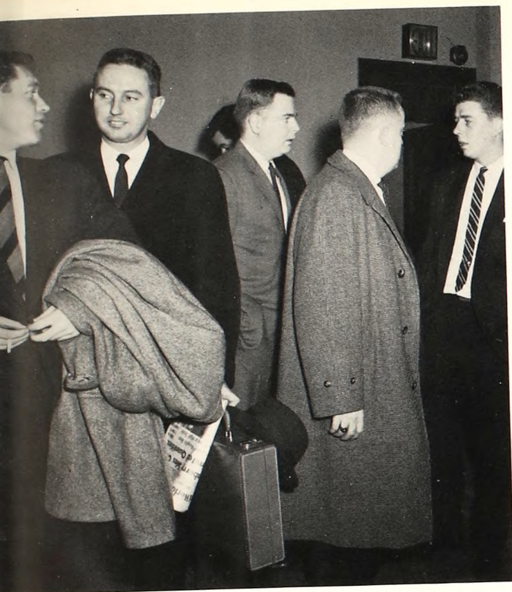
The Loyalty Fund Campaign and the April Communion Breakfast were among the many topics discussed between classes at Court Street.

Early arrivals find time to scan the day's headlines or just chat before the heavily travelled corridors would fill again.