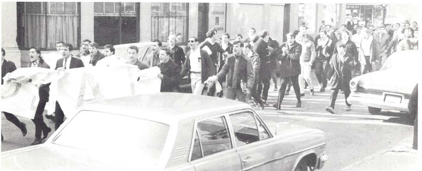
. . . went this-a-way