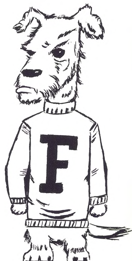
Who's this Snoopy bum?