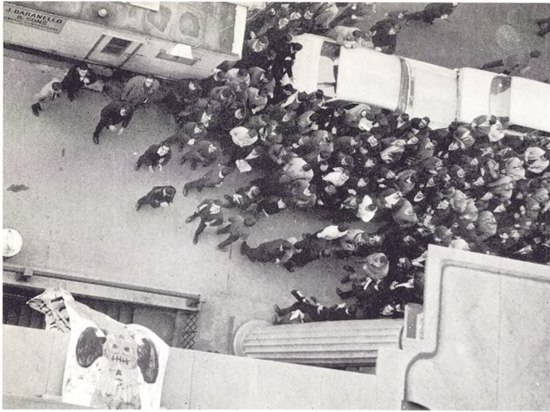
The march on St. John's started here . . .