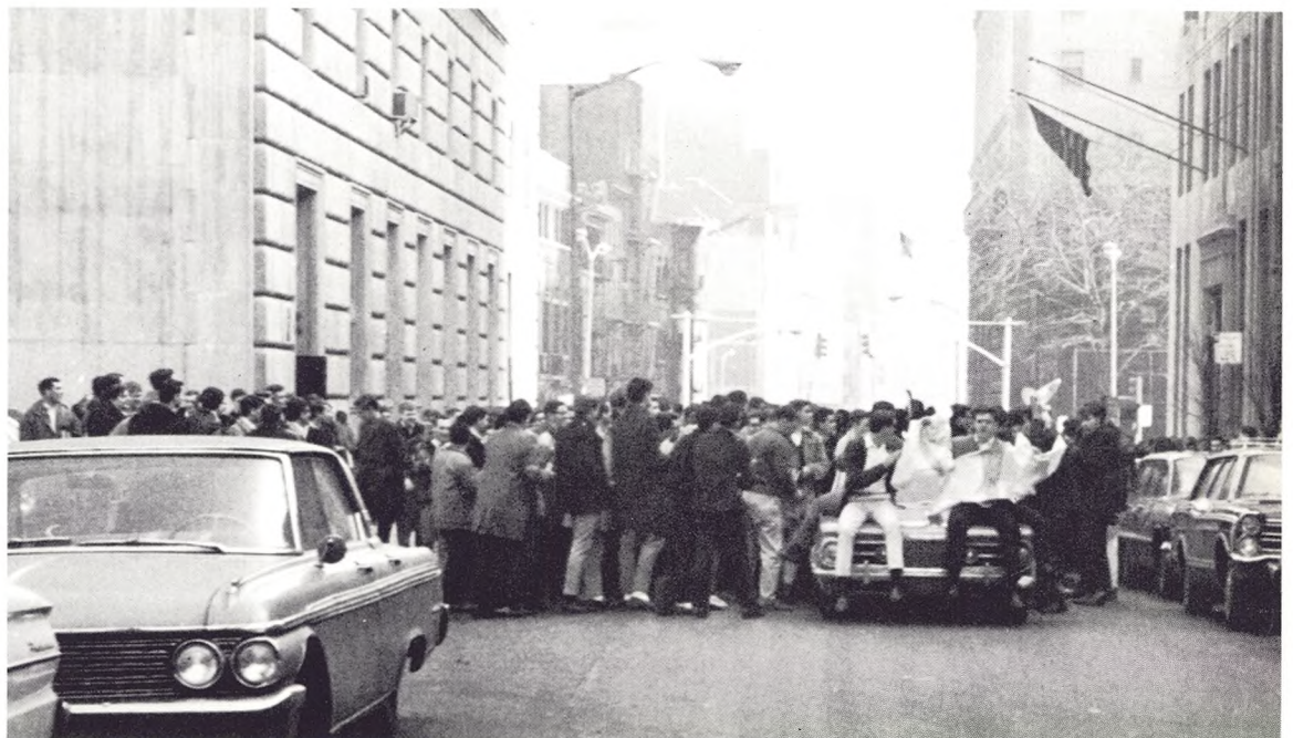
. . . and ended here.