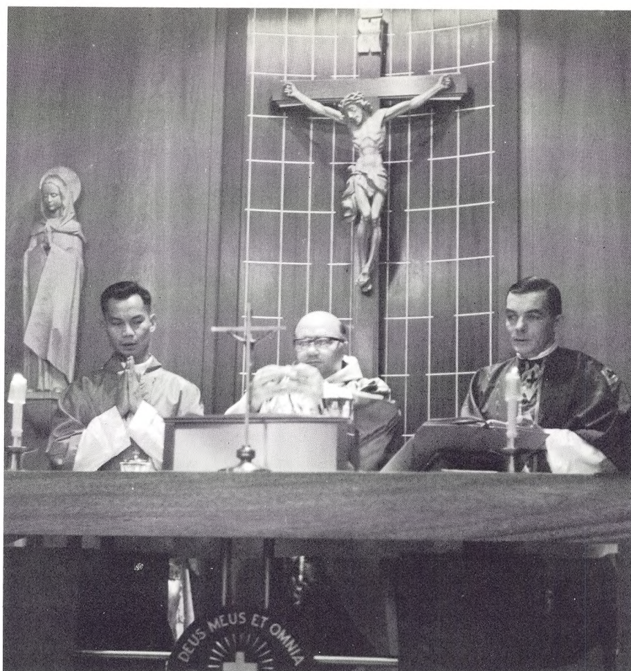
The year was not without its serious moments . . .