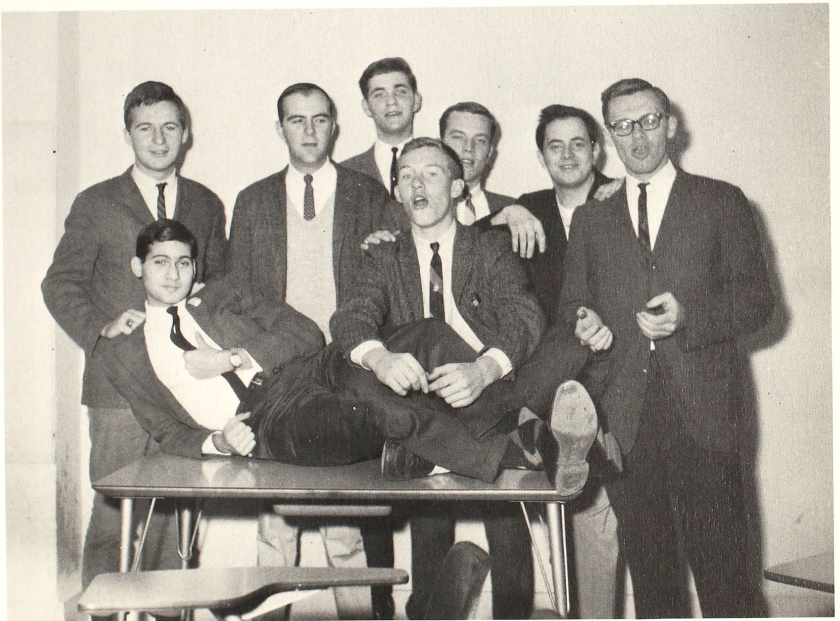
As other folk massed.