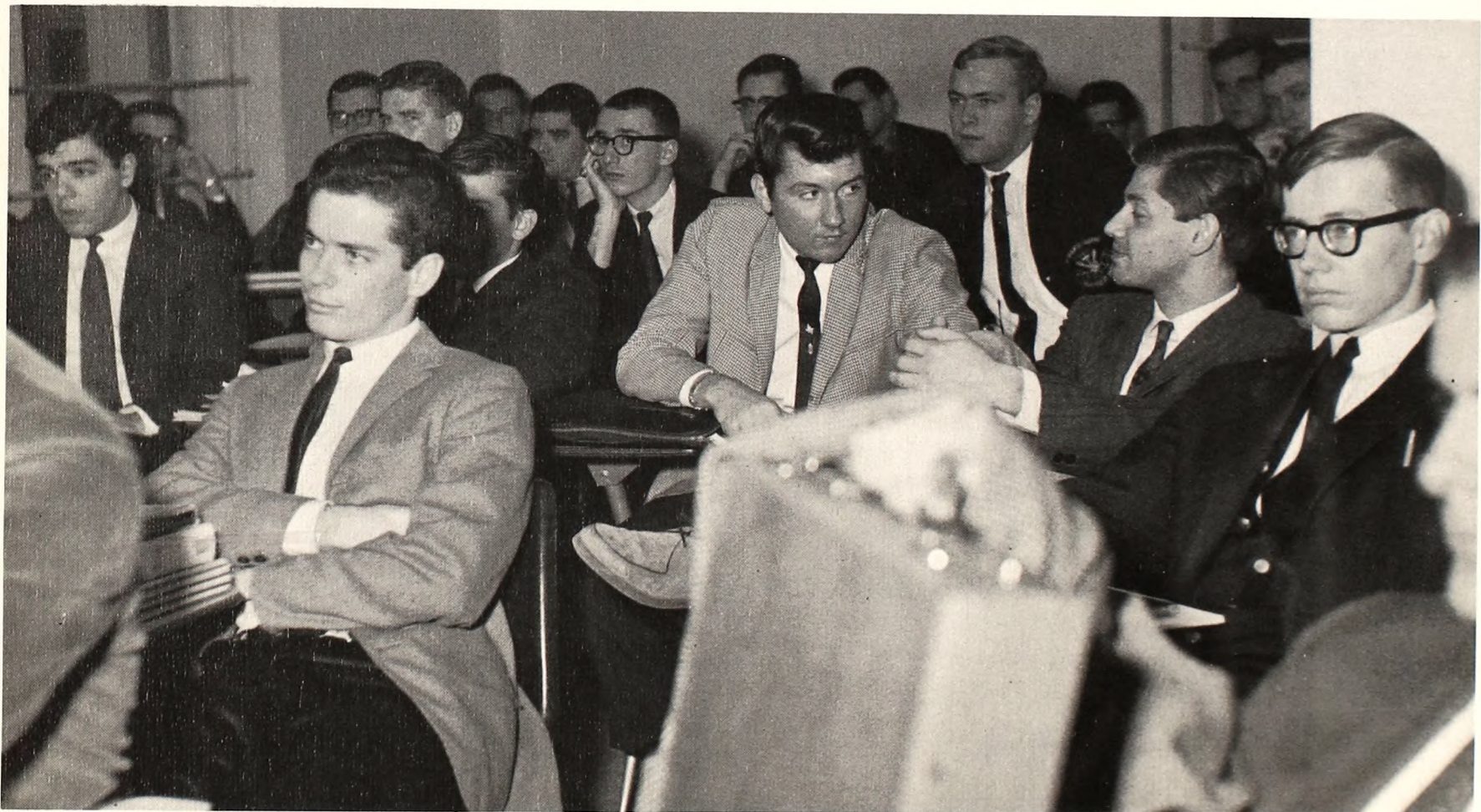
Seniors thought of the Prom—and how to pay for it.