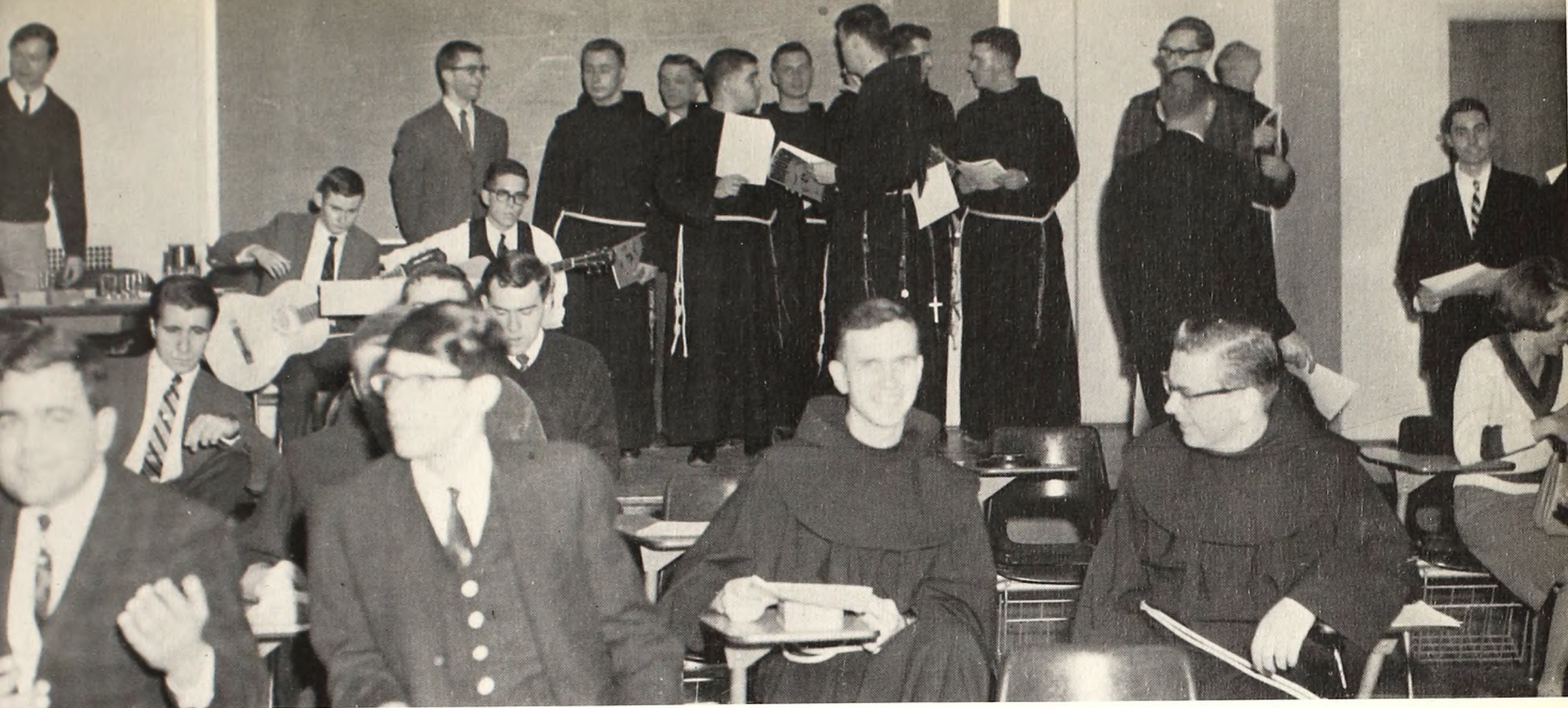
The Ecumenical movement brought Folk Masses to St. Francis.