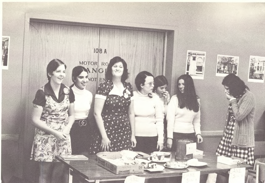
"Hey Ellen, I think Debbie had some of your cookies."