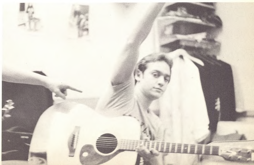
This man uses "Sure" under his right arm.