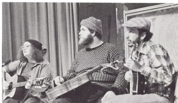
"And we're the Wonder Beans."