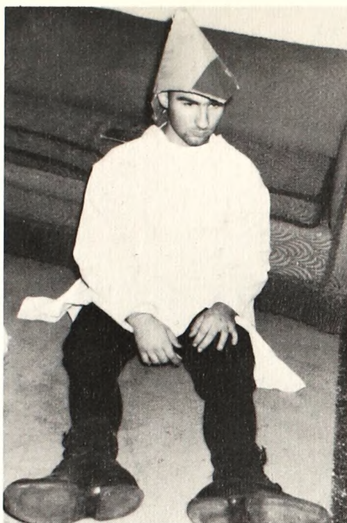
"Who wobbled my wabbit?,"