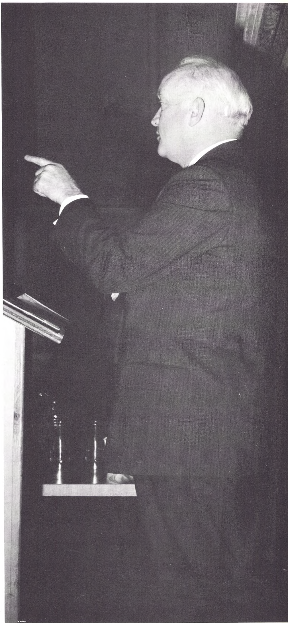
James B. Donovan, candidate for the United States Senate, responds to question at I.R.C. lecture.

During the New York Senatorial race, the campaign trailed candidate James B. Donovan to St. Francis. Mr. Donovan, negotiator for the release of Castro hostages and President Emeritus of St. Francis' Council of Regents, spoke as a guest of the I.R.C.