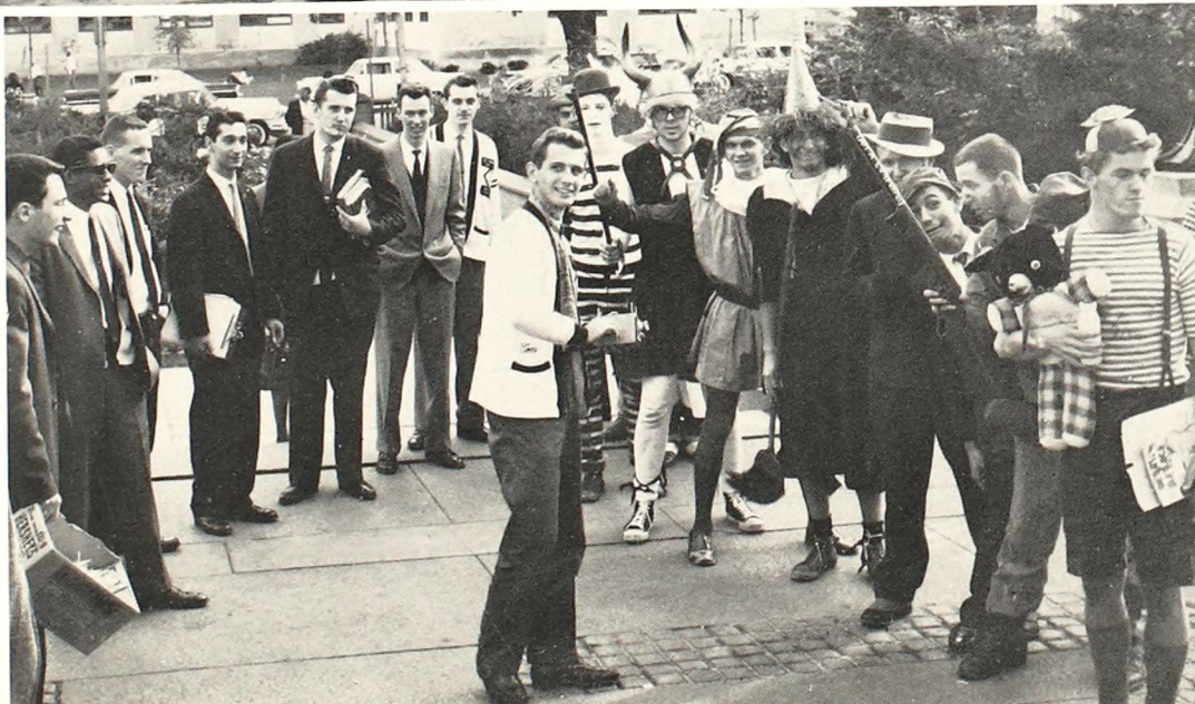
Phi Rho dogging ran through the week of October 19th. Fourteen students completed the rigors of the week's activities and were welcomed as brothers of Phi Rho Pi.