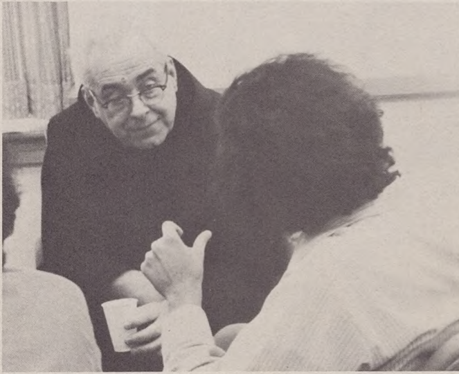
That is a very astute observation Brother.