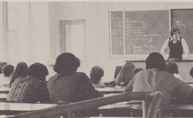
Psst, what's the answer to 14?