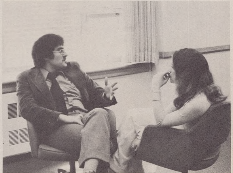
Shoot! It wasn't all that brilliant.