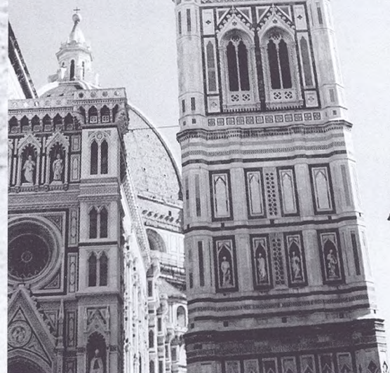
▲ Florence: a view of Giotto's Bell Tower with a view of Brunelleschi's Dome over the duomo or cathedral of Florence.