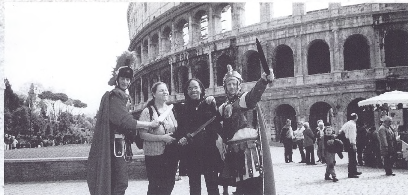
Dr. Jackson and Desiree are attacked by Roman soldiers outside the Coliseum.