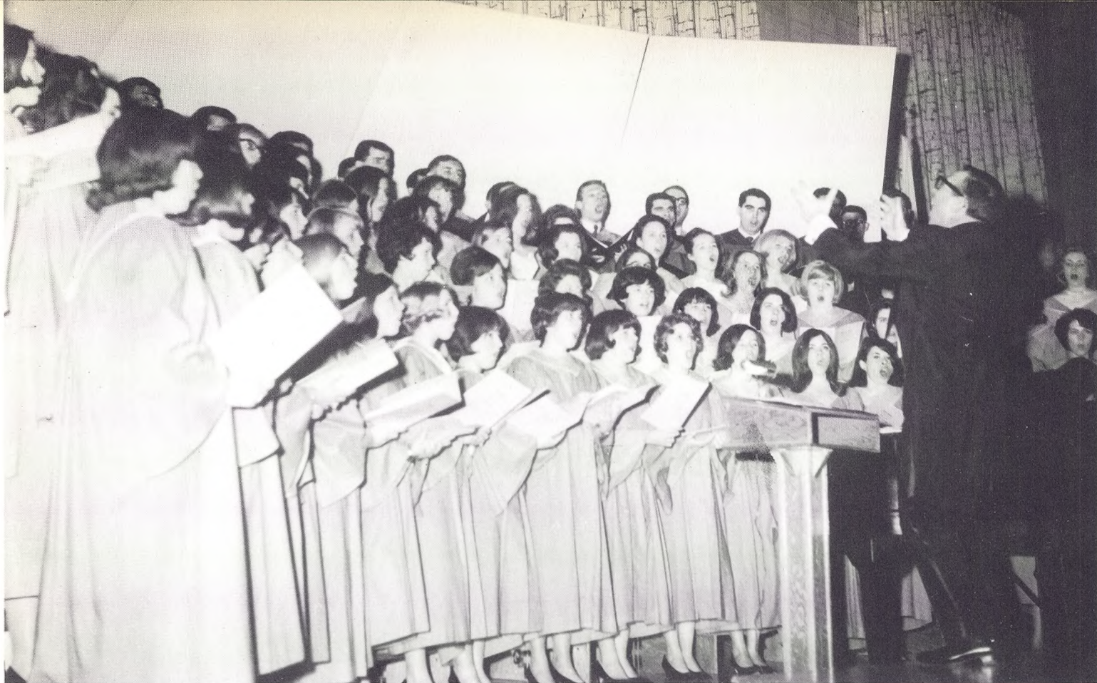
Concert time finally arrived and our hard work was about to pay off.