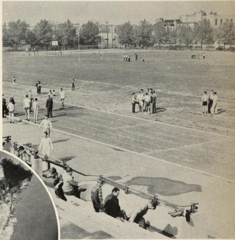
Red Hook Stadium