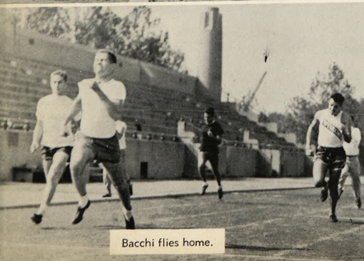
Bacchi flies home.