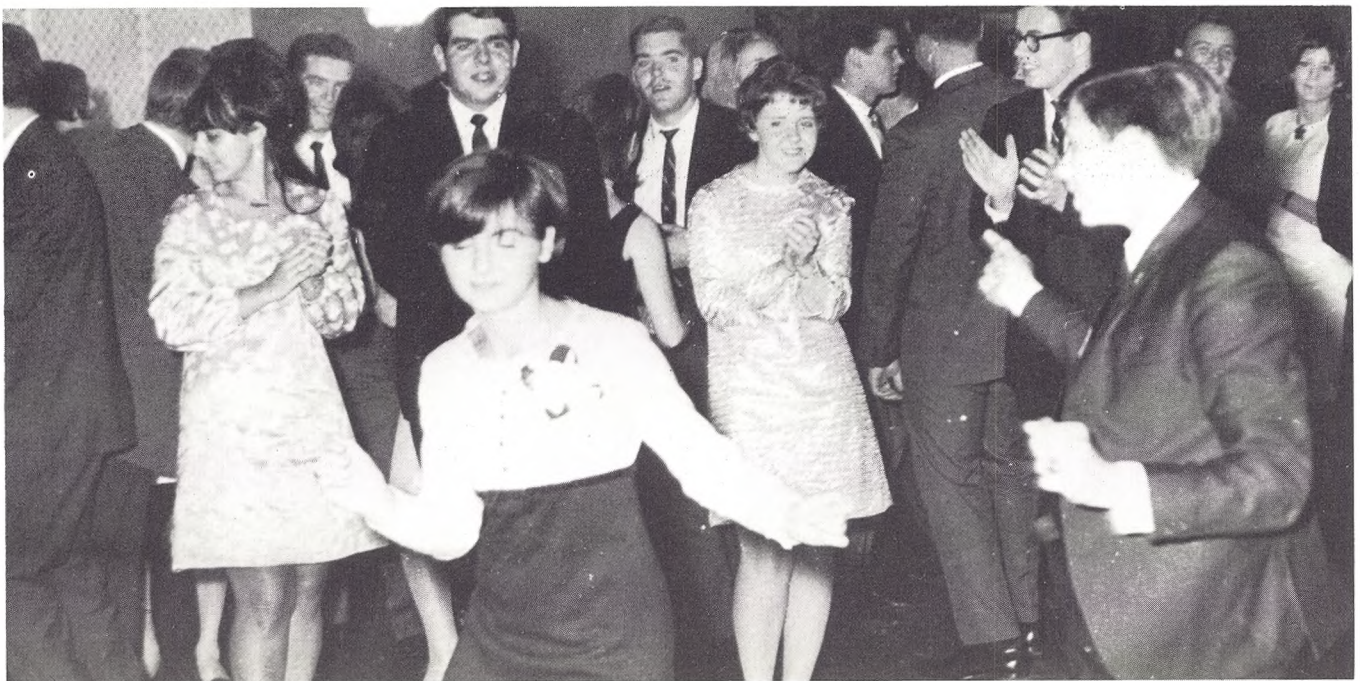
A scene from the annual Pi Alpha Ball held in New York.