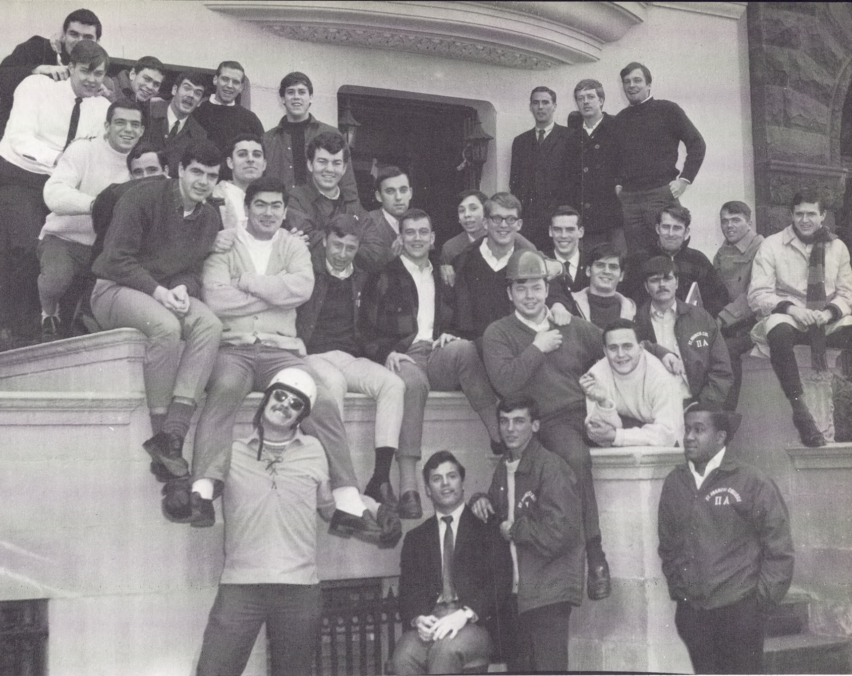
Whenever it's warm the brothers step outside and watch the grass grow.