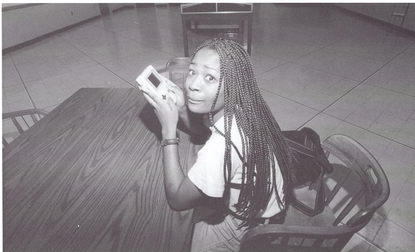
"I NEED MY GAME BOY!!!! PLEASE LEAVE US ALONE!!"