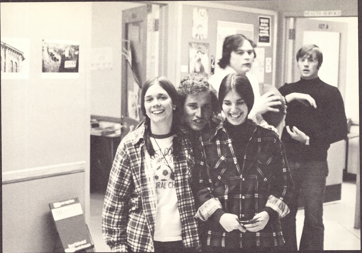
The Editors at play