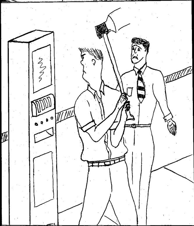
But your not morally justified! It's only a nickel.