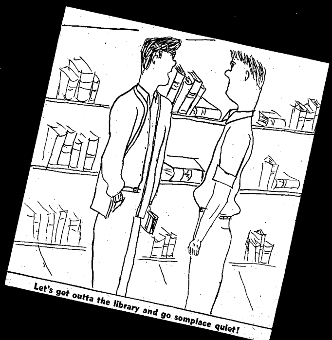
Let's get outta the library and go somplace quiet!