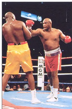
Focus on Sports

Whenever the Magic, led by 7'1" 300-pound Shaquille O'Neal, score 110 points, the Orlando McDonald's restaurants redeem home game tickets for a free Big Mac. With the team selling out all 16,000 seats, the Golden Arches supply a massive Mac attack, consoling fans for the lack of a playoff victory.