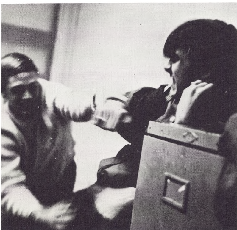
or got edgy . . .