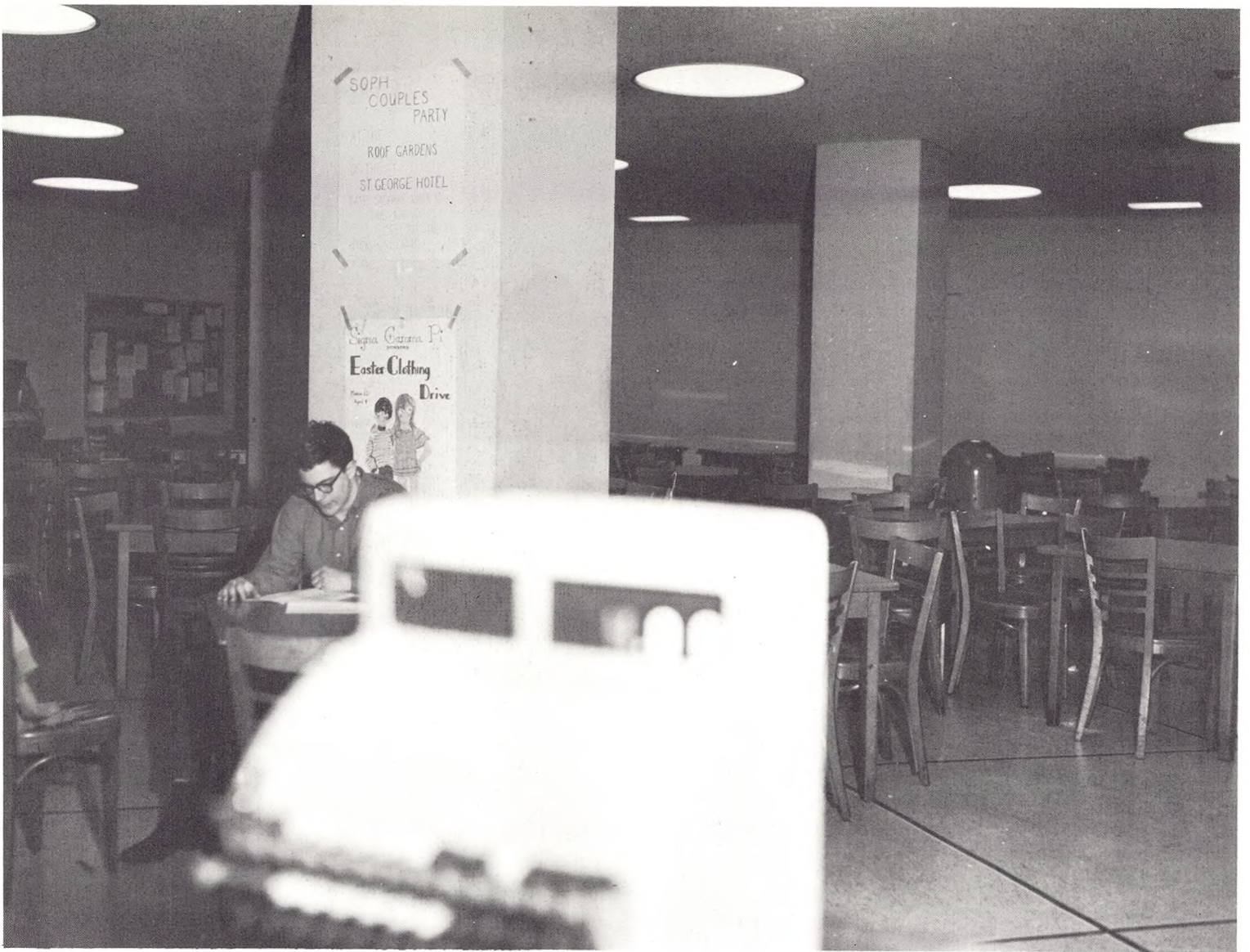
Brady food service did its usual job of packing the cafeteria . . .