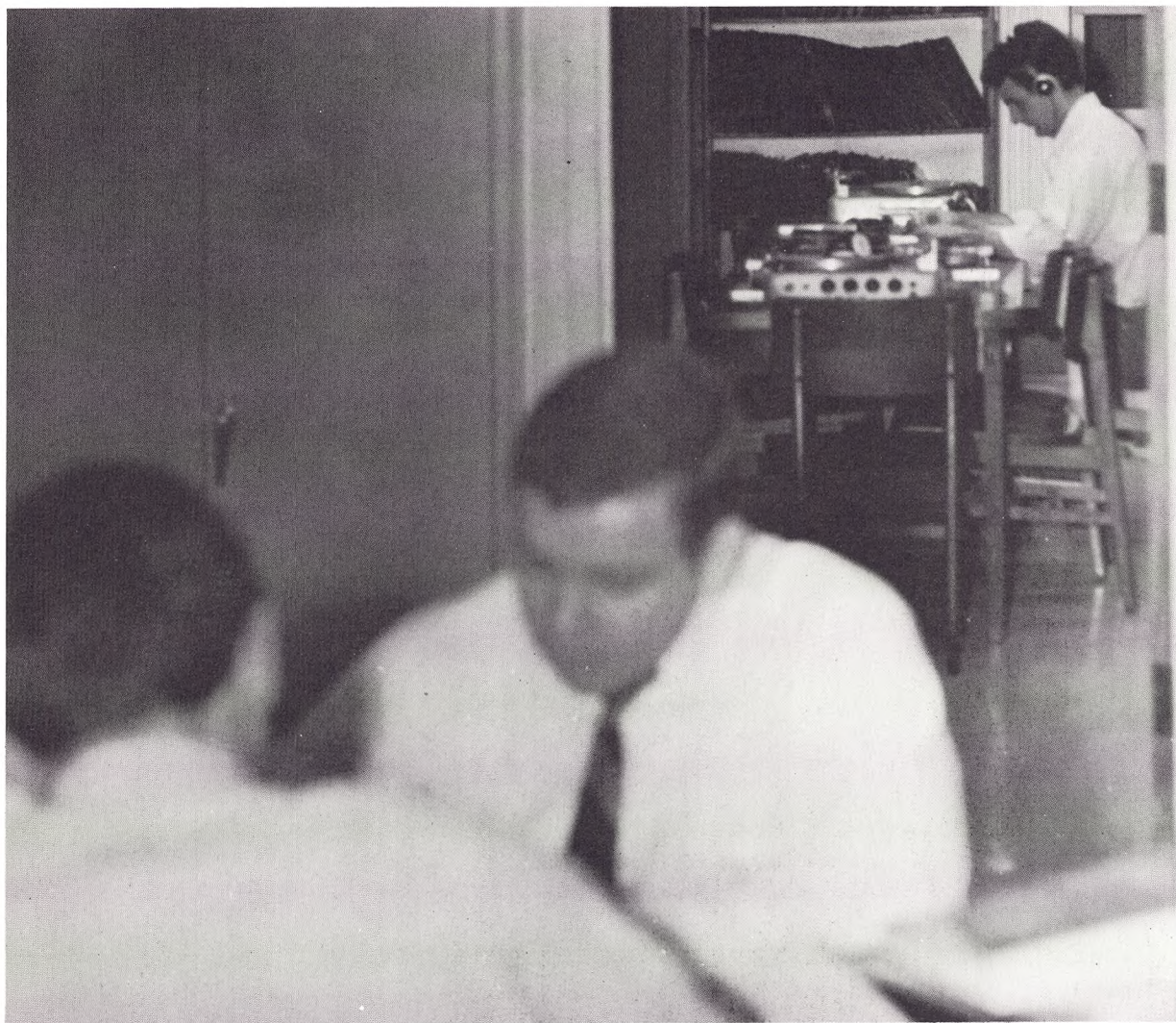
As final exams came closer some of us sought soli- tude . . .