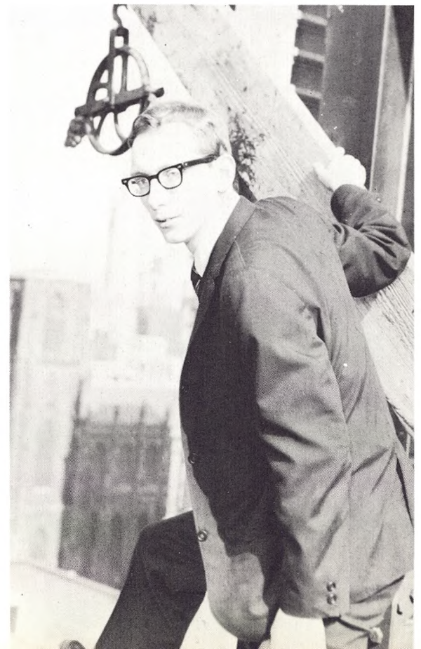
after satisfied customer.