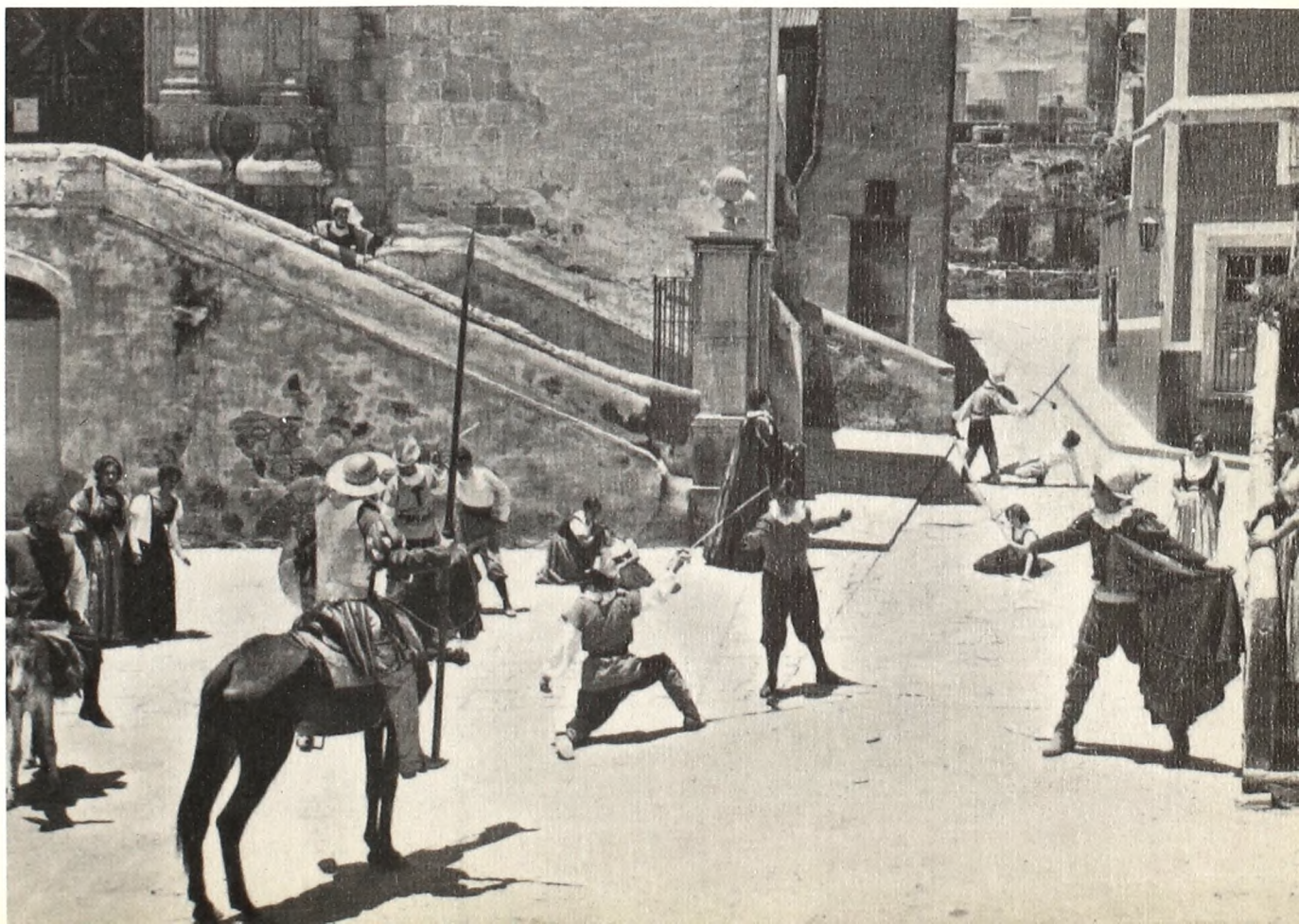
Plays were performed in the plazas using natural scenery for sets. Here we see Don Quixote being performed in the streets of Guanajuato.