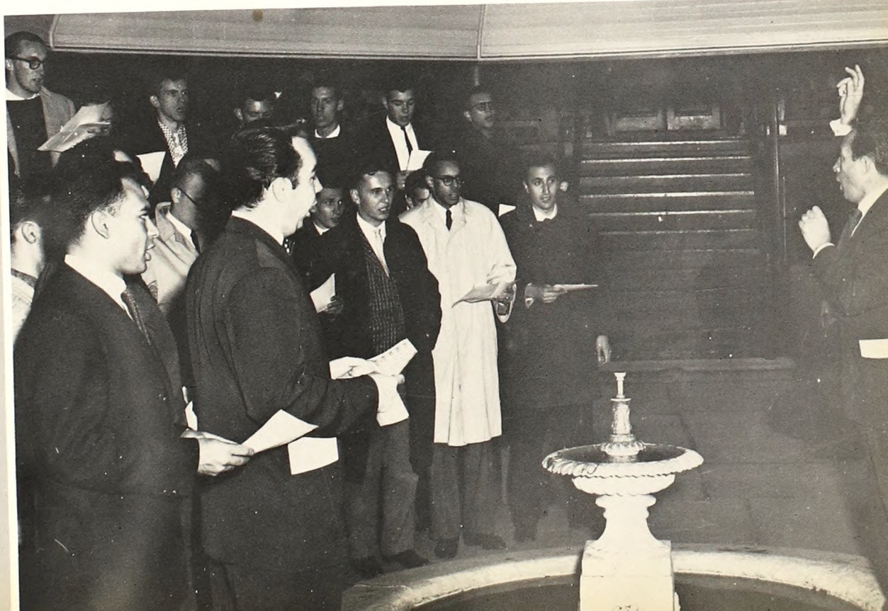
The dedication of the Moran Student Courts saw the Glee Club singing the Alma Mater under the arbor.