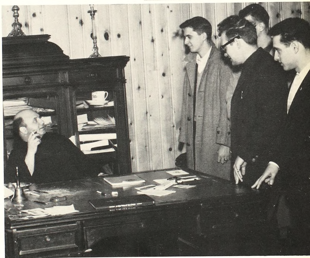
Informal chats during the day enabled the seniors on retreat to discuss further many of the topics treated by Father Joachim.