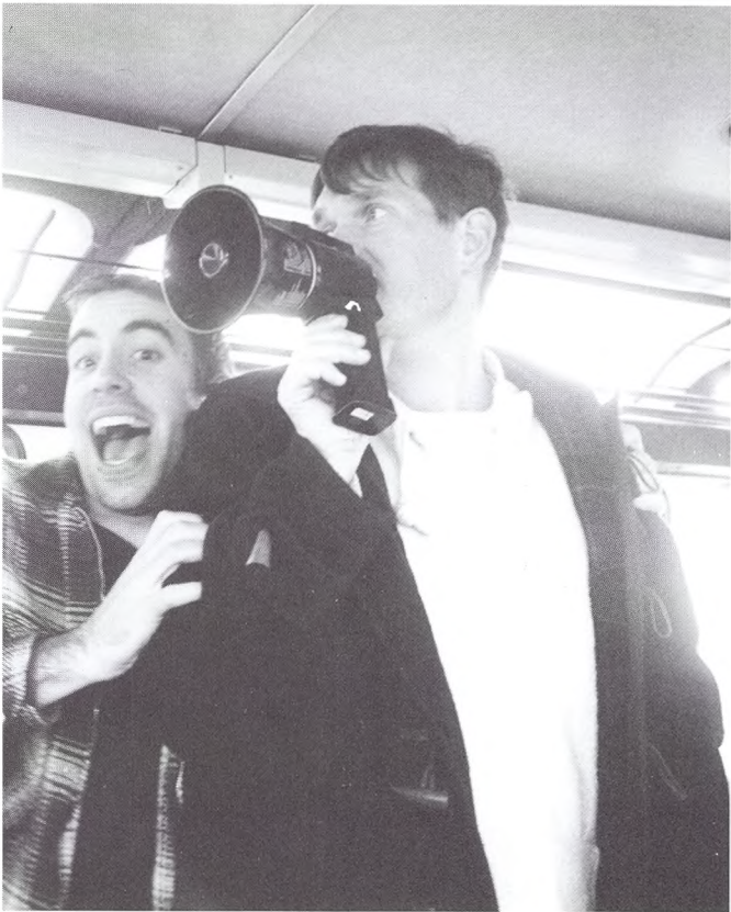
"MOVE OUT OF MY WAY, I AM A MAN WITH A MISSION!!"