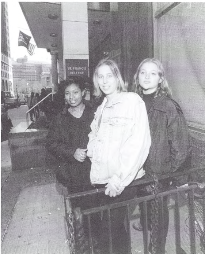
The women of St. Francis scoping out the scene . . . looking for their next victim!