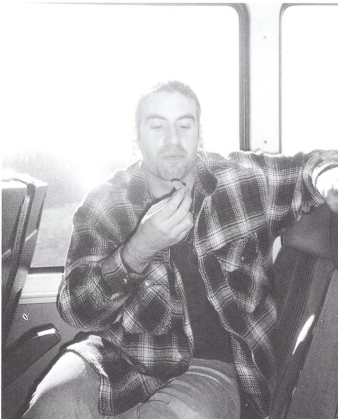
"Now this is very strange . . . I didn't think something this size could fit in my nose?"