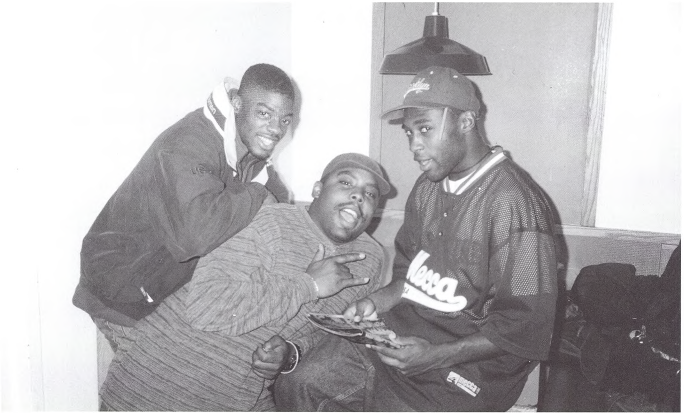
An example of the gorgeous men at St. Francis College!