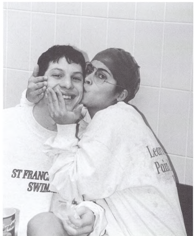
"The women love me . . . I am irresistible!"