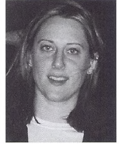
Herff Jones Rep.