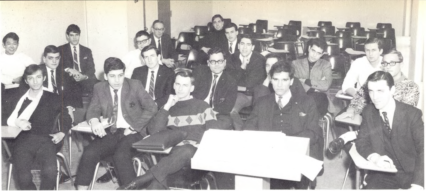
The membership meets to plan their trip to the Naval Medical Research Center.