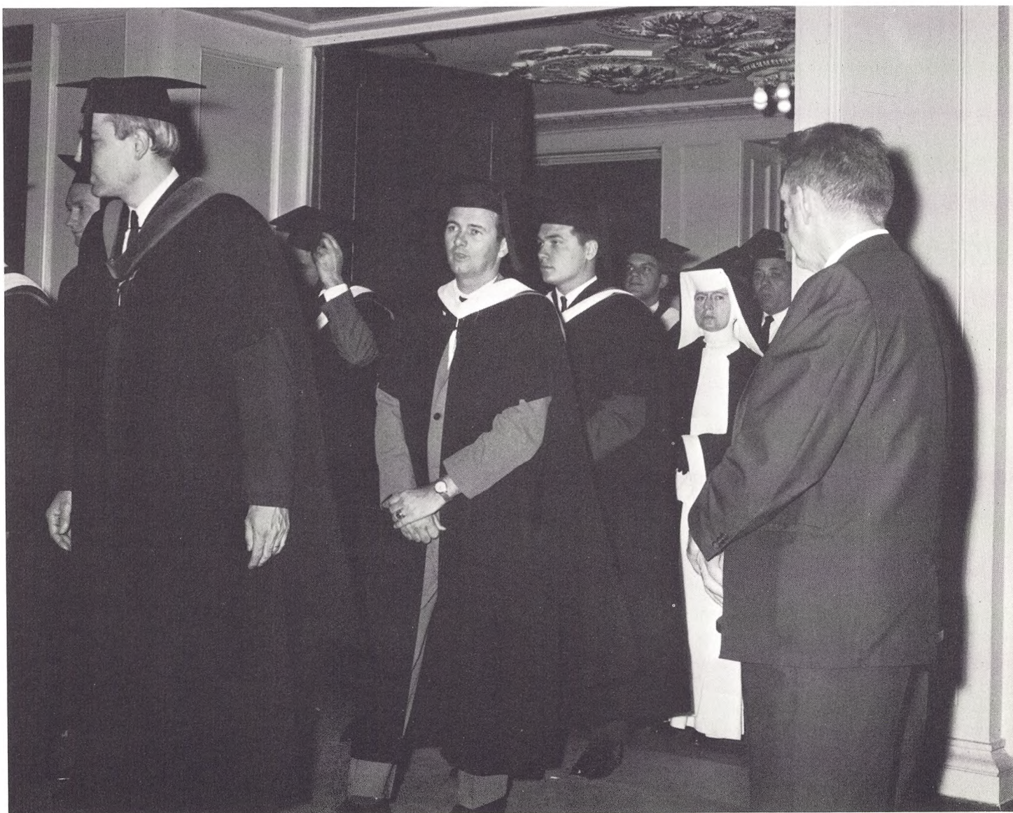
The culmination of sixteen years of genuine effort.