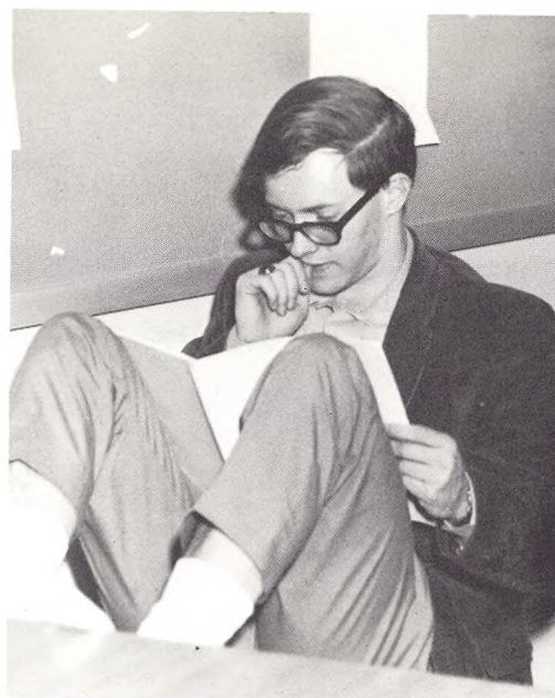
meditation . . .