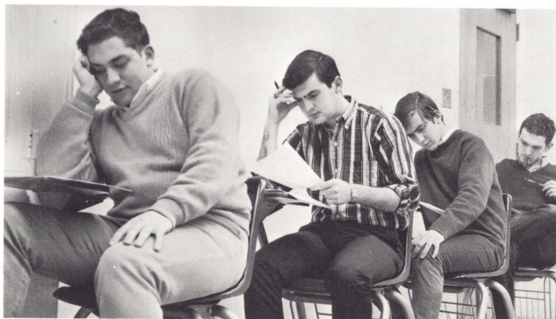
pensive investigation of the question . . .