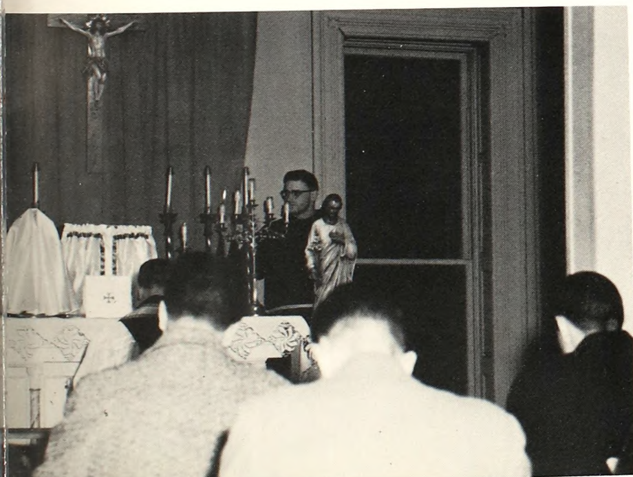
Prayers and Benediction follow each monthly meeting.