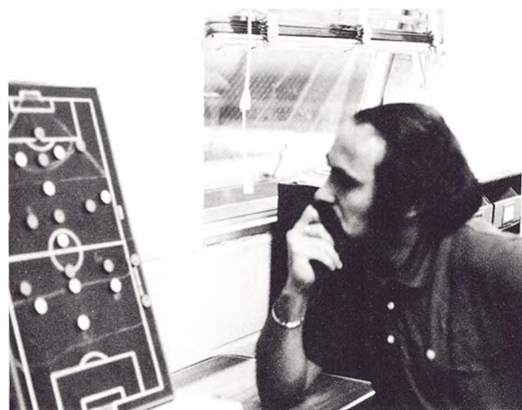
"Let's see, I can make my move at halftime."