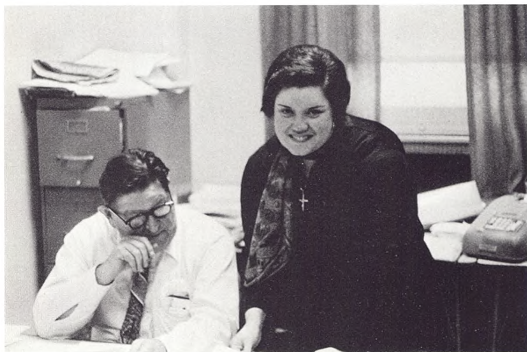
"He's so cute when he whispers those sweet little nothings."