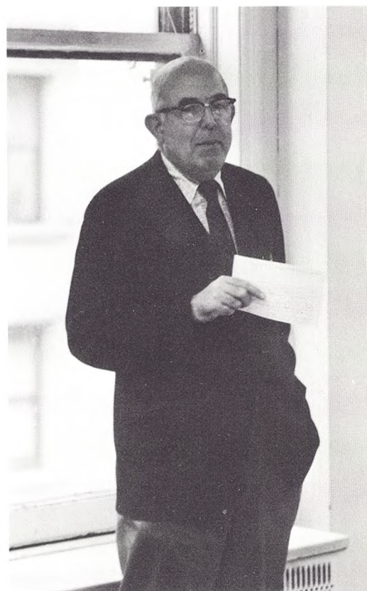
"Hey, where did everybody go?"