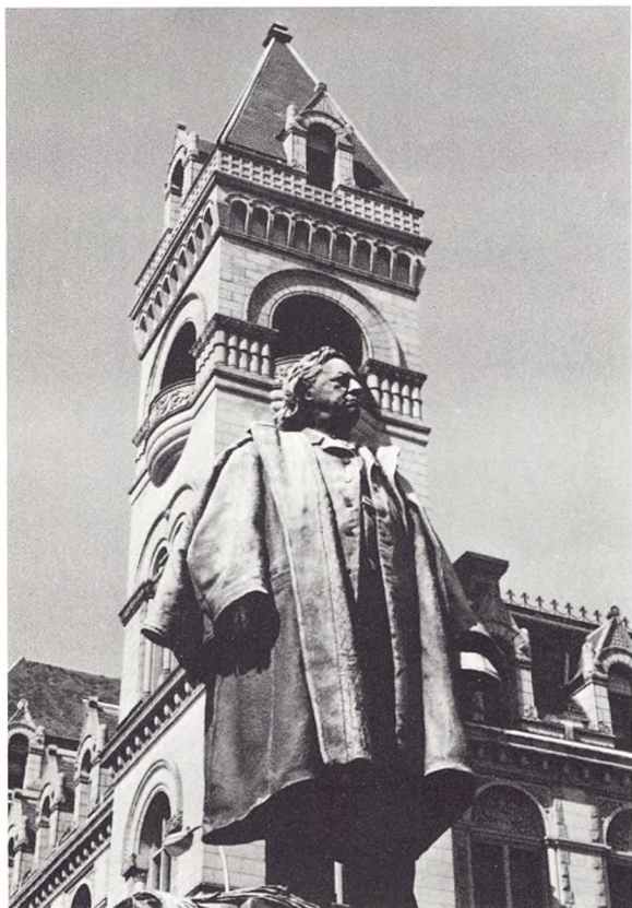
Before. "I've had it with those damn pigeons! I'm Leaving!"