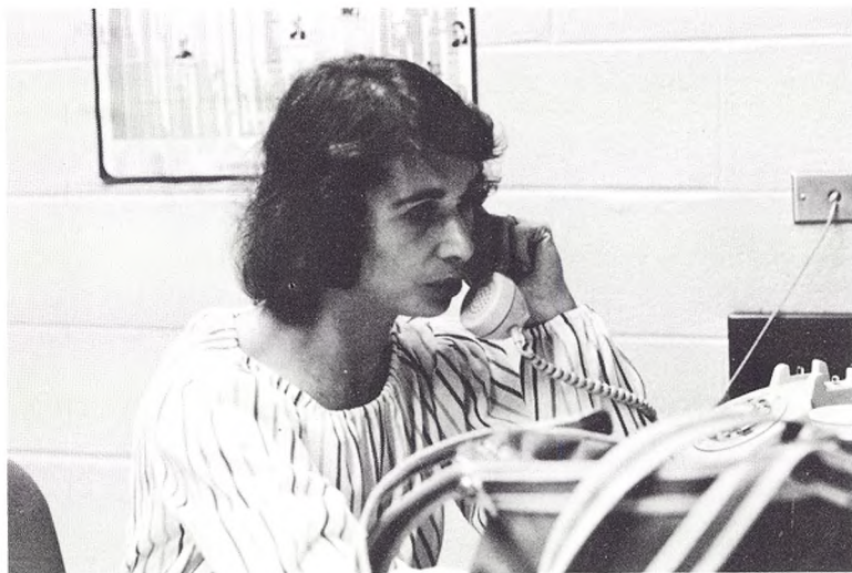
"Lou, I've got a paranoid schizophrenic on my hands. What should I do?"