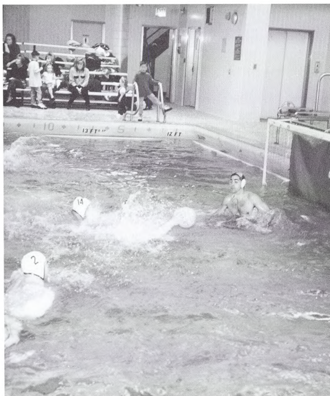
Number 14 scoring points for the team.