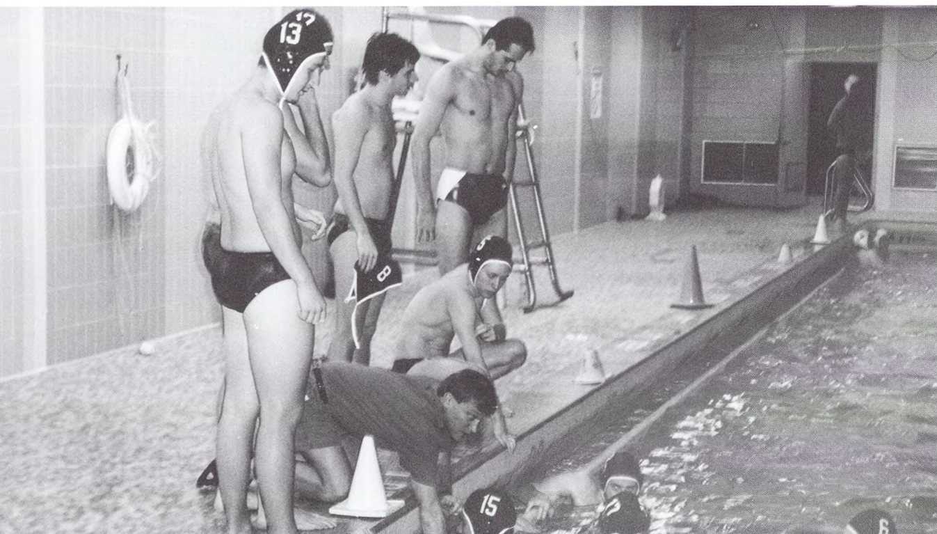
Coach Cutrone talks strategy with the members of the Water Polo Team of SFC!