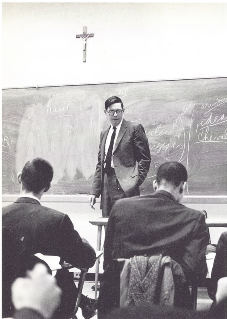
Oh yes, there were classes . . .