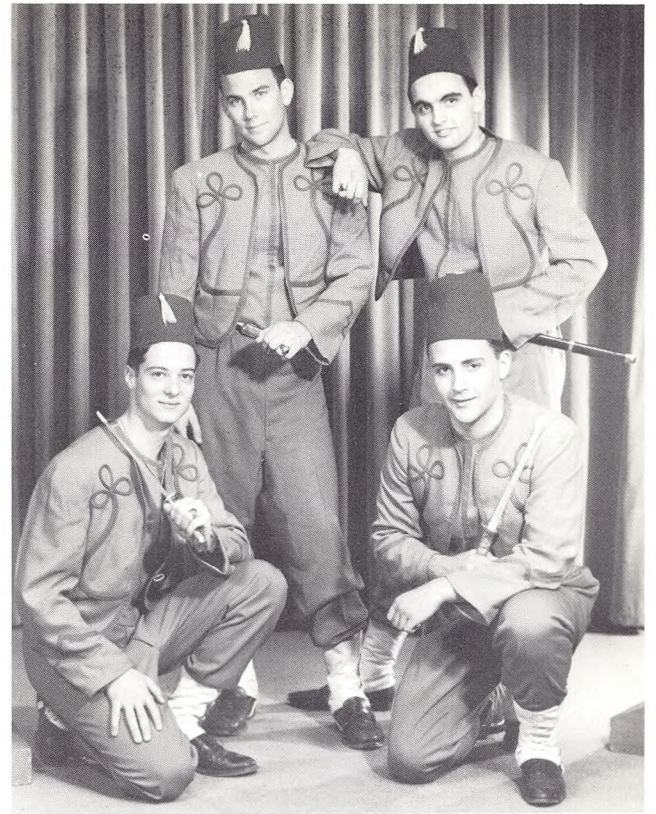
. . . new dress regulations.