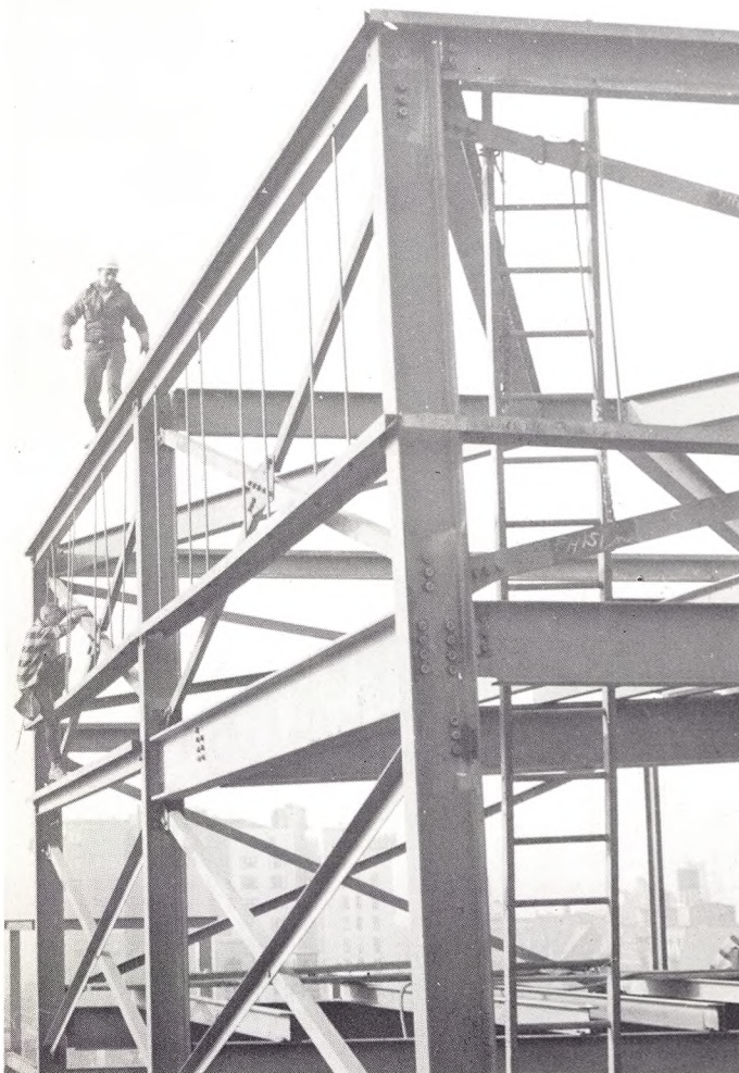
The administration bought us an erector set . . .