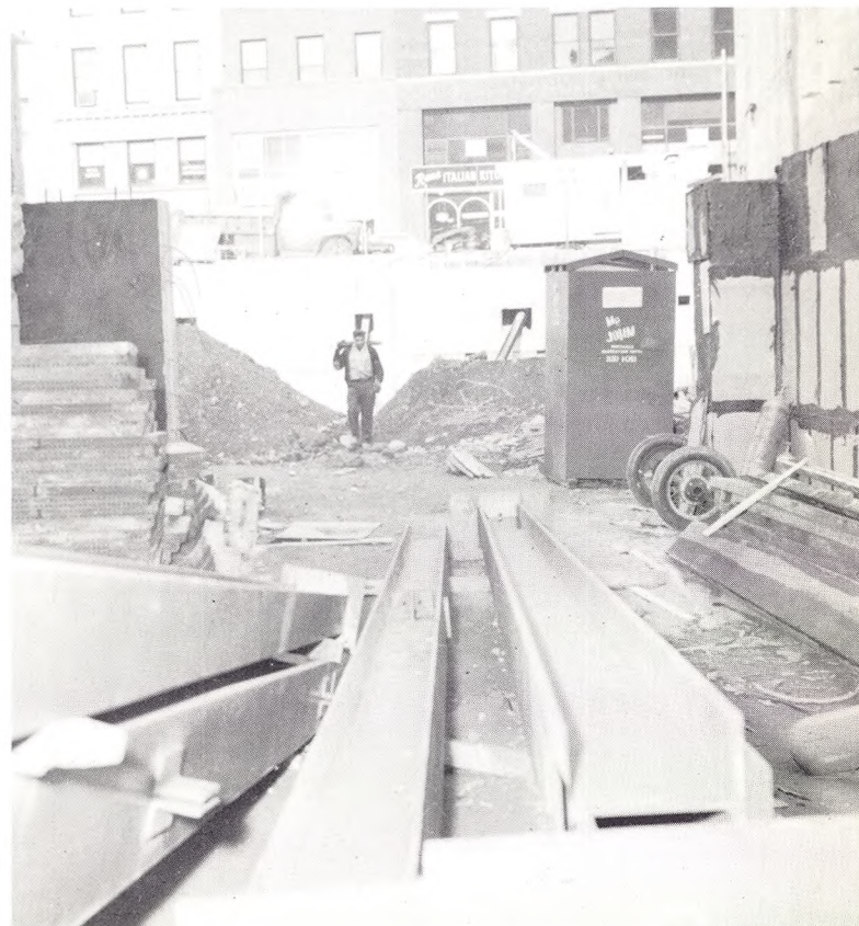
. . . and new plumbing facilities.