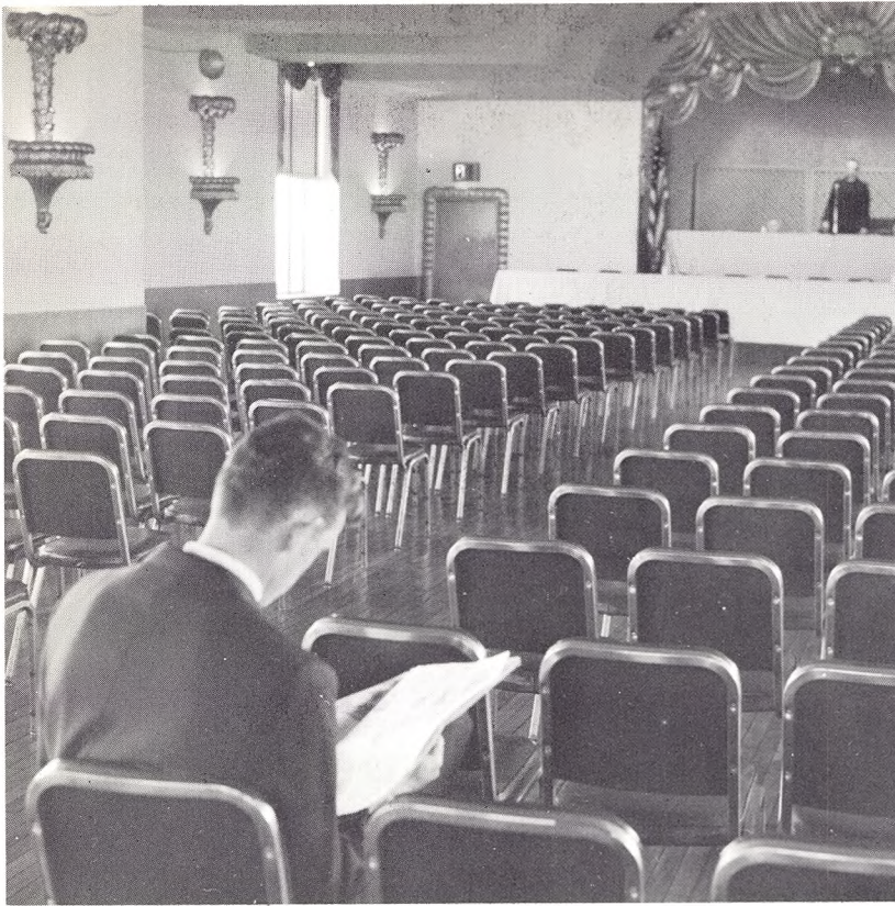
I called you together today to tell you about . . .