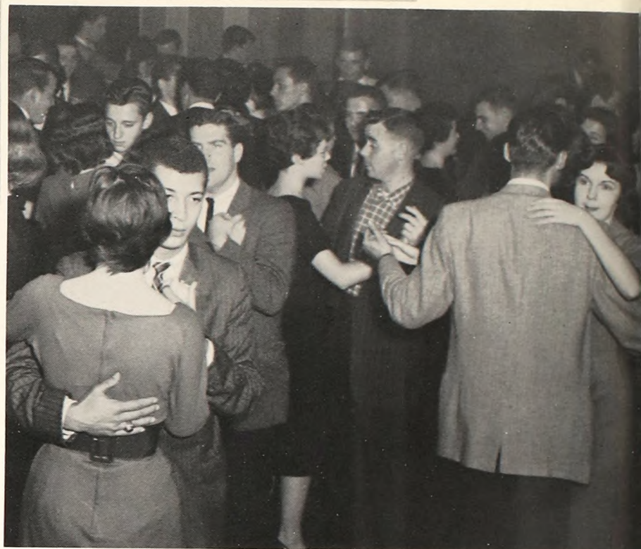
To help defray the costs to the seniors of their June Prom, the Senior Class sponsored a dance on November 6th. This dance, coupled with a successful co-op campaign, enabled the cost of prom bids to be reduced considerably.