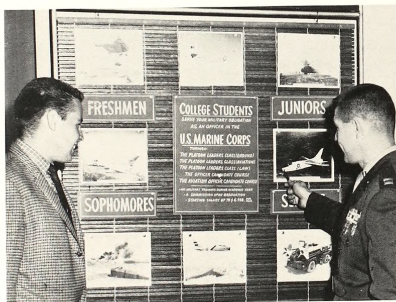
The Marine Corps' Platoon Leaders Course offers many advantages to the undergraduate. Several times during the year the Corps sent representatives to campus to inform the students of these benefits.