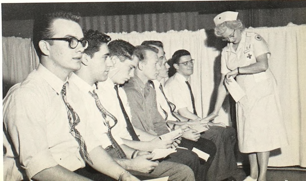
The annual blood drive netted the college blood bank an additional 105 pints of needed blood. A group of students go through a phase of the pre-donation check-up.