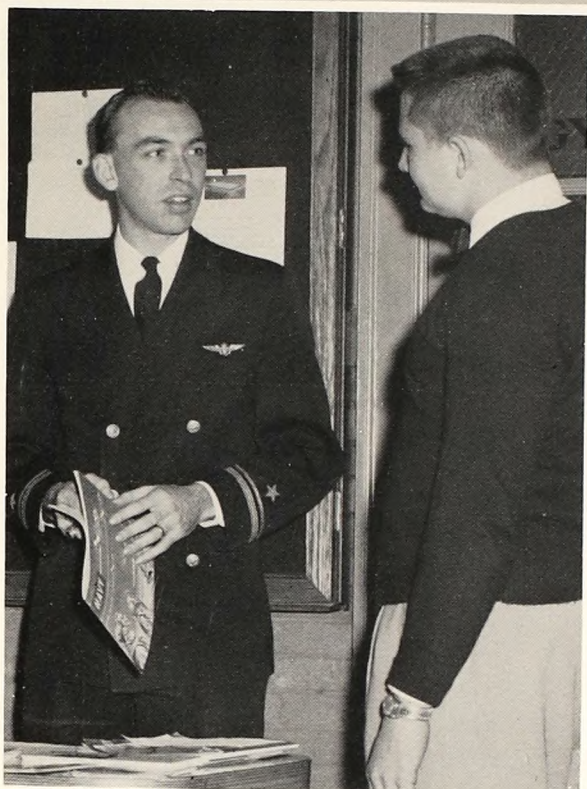
Realizing the necessity of having the students well informed concerning their future military obligations, permission was given to the various branches of the Armed Services to distribute information and recruit members for their Officer Training Programs.