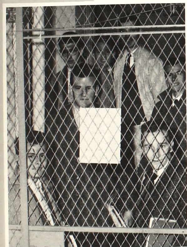
Several students found the Lounge "off limits" on December 8th. The reason was the Red Cross Blood Drive.