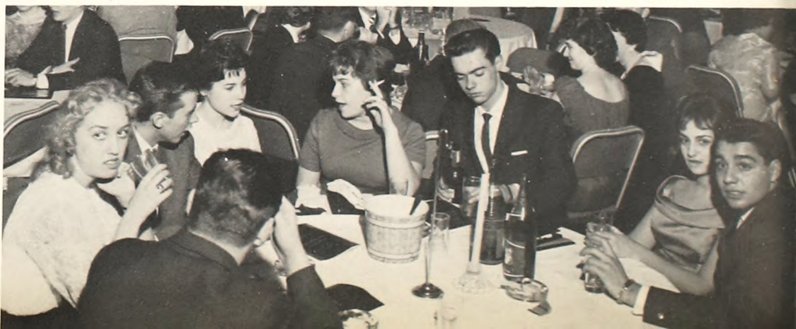
The Annual Thanksgiving Dance, sponsored by Pi Alpha Fraternity, was held on November 27th at the Hotel New Yorker's Terrace Room. The dance was the social highlight of the year.