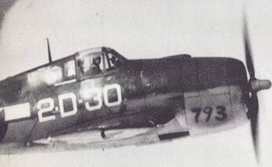
OUT OF THE ARCHIVES: MODERATOR IN FLIGHT 1943.