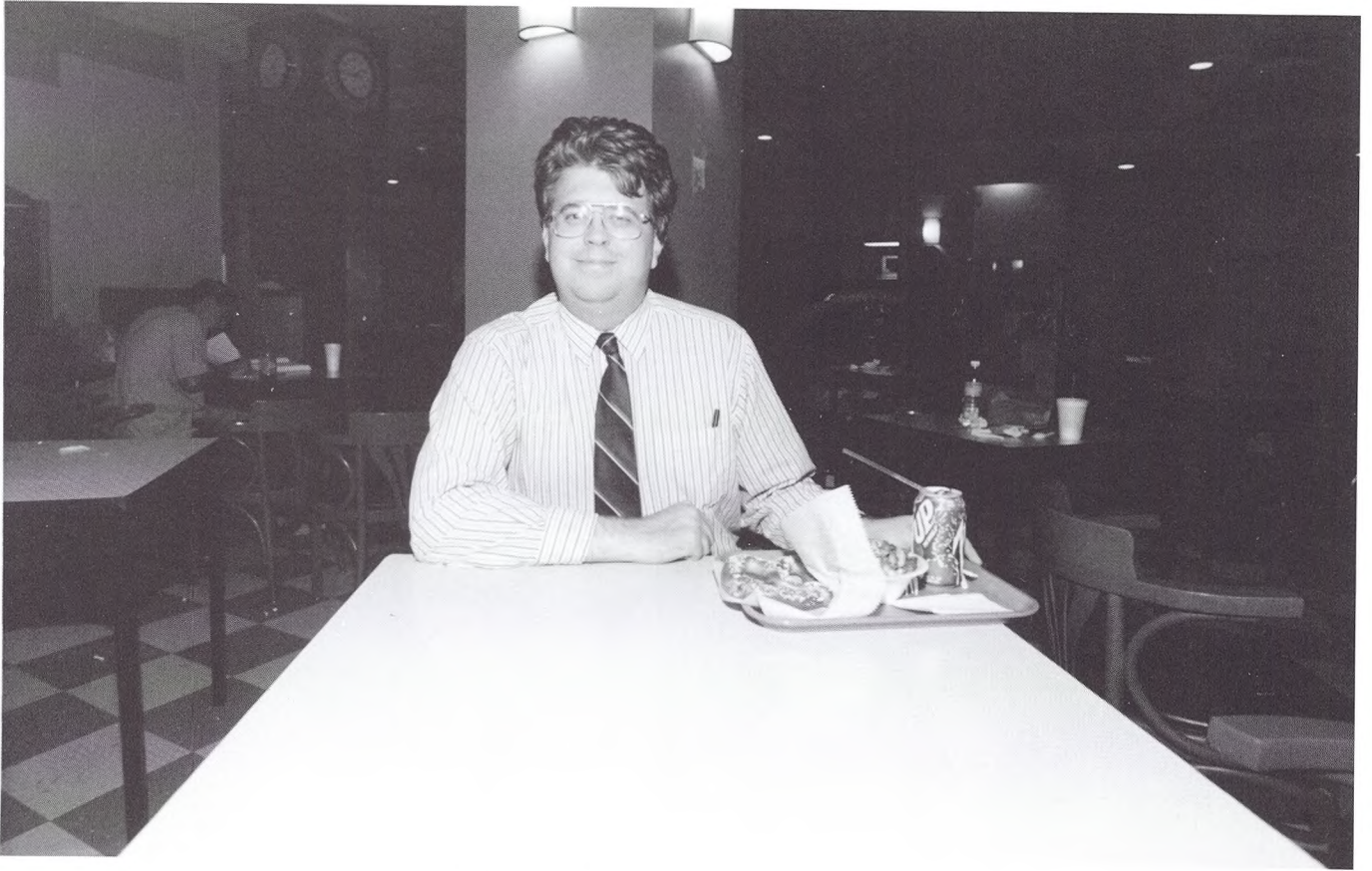
I am the only one that smiles like this after eating cafeteria food.