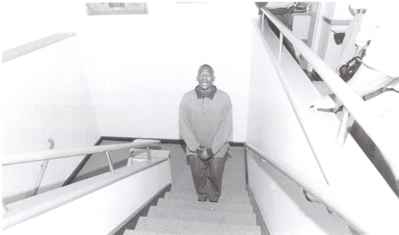
Pleeeeeease tell me where the bathroom is?