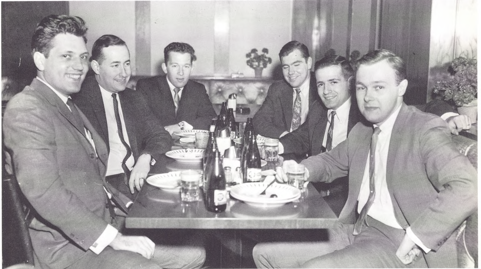
Nocturnal refueling keeps morale high at Association meetings.

The Association of Evening Students was formed to promote the interest of evening students in the extracurricular activities of the college. Since its beginning eight years ago, it has grown from an idea to an organization with the largest membership in the college.