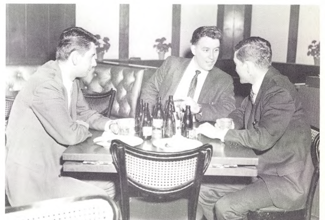
"I won't tell you who's responsible for all these empties but I'll point at him."