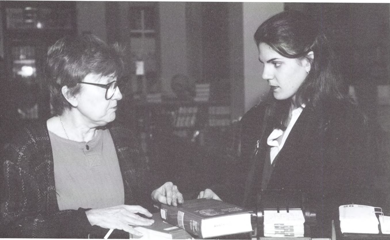
The faculty and staff are always ready to help the students any way they can.