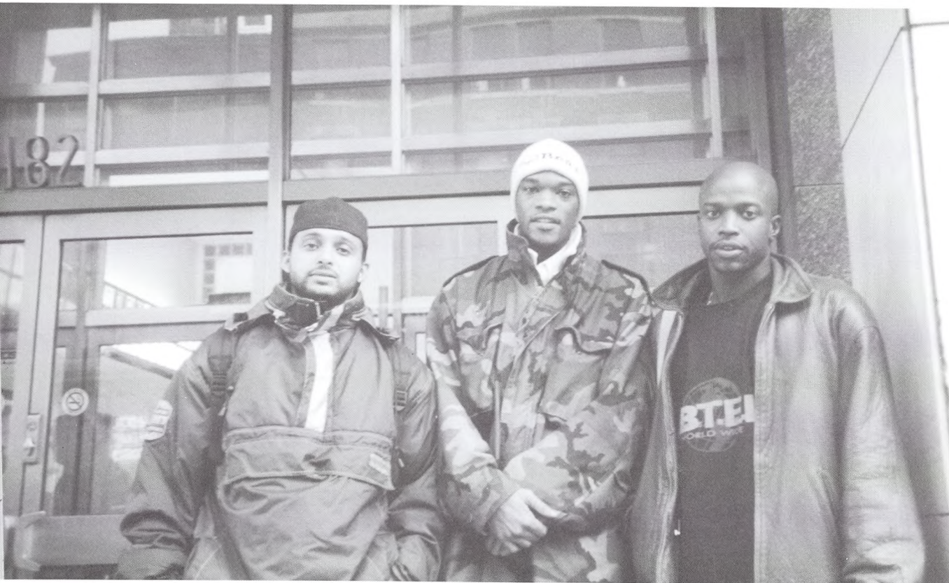
Our multi-racial campus is exemplified by the 40 countries that are represented in the student body attending St. Francis College.