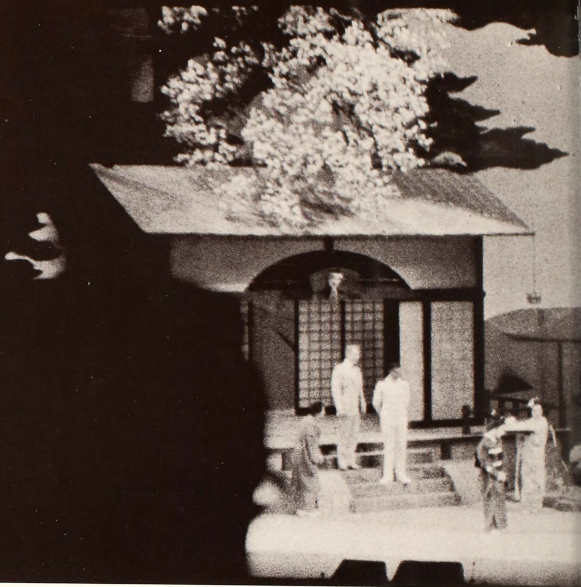
PUCCINI'S BUTTERFLY, presented by the Metropolitan Opera Company. Members of the club enjoyed this production from their private box.