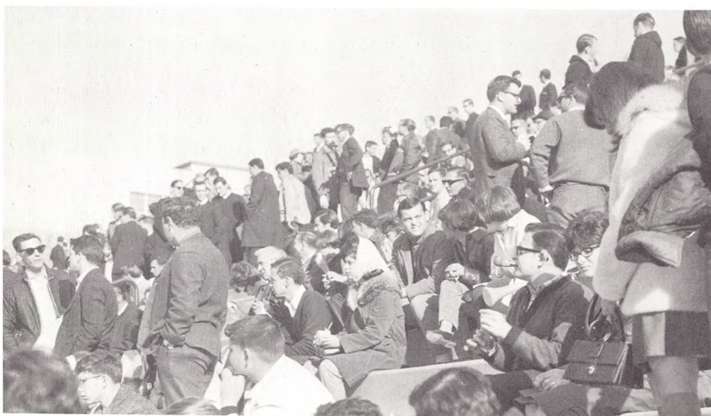
Large turnout for the St. John's game.