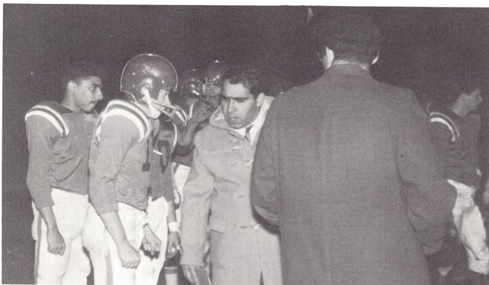
"You want to go to the bathroom now?"