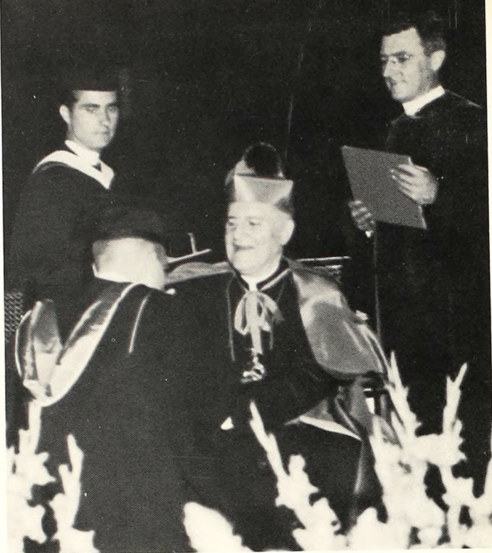
A graduate kisses the Bishop's ring after receiving the degree.