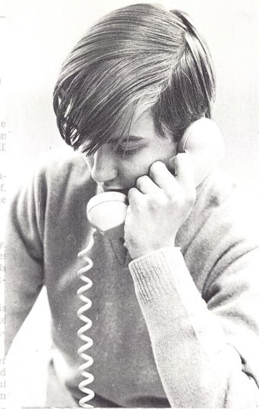
"Could you give me an estimate on your haircuts?"

n by the current editors, is the publication. Though one or, this is hardly "the mea-