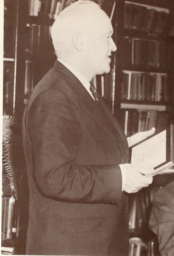
JAMES BRITT DONOVAN , New York attorney internationally known for his role in the Powers-Abel spy exchange, led the College's Board of Regents for half of the year. Here he accepts award for meritorious service. Adding honor to award, Mr. Donovan, in early fall, was appointed as Vice President of the Board of New York City Education.