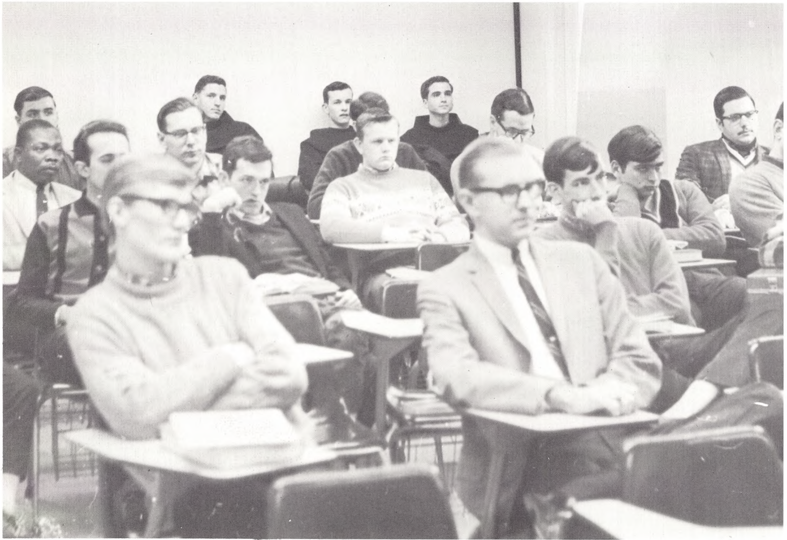
The future teachers of New York listen to a lecture by one of New York's best.